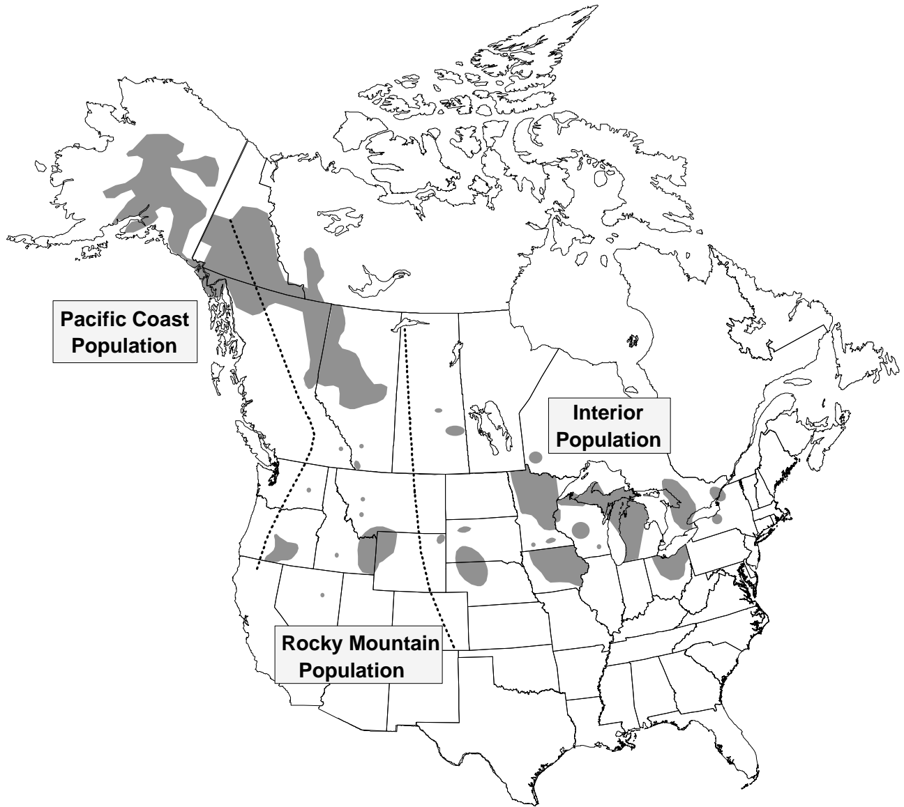
Fig. 1. Approximate ranges of Pacific Coast, Rocky Mountain, and Interior populations of trumpeter swans during late-summer of 2000.