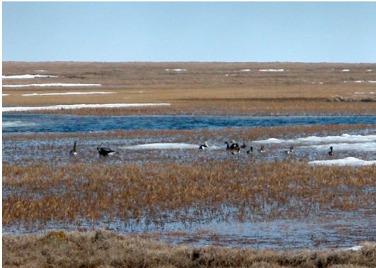
Mixed flock of waterfowl on Arctic Refuge coastal plain.

For more information about visiting Arctic Refuge go to http://arctic.fws.gov/ or call 800-362-4546.