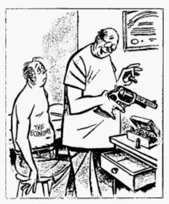
'Feeling a little sluggish, eh? What you need is a good shot in the arm.'

In 1967, the President requested the Ninetieth Congress to enact a 15 percent across-the-board increase in monthly Social Security benefits, as well as the expansion of Medicare to cover 1.5 million disabled Americans under the age of 65. The Committee on Ways and Means under Mills' leadership refused to extend Medicare, arguing that the additional cost would have threatened the financial soundness of the program. The committee did agree to a 12 percent increase in Social Security benefits, which was later raised to 13 percent in the final conference committee report.