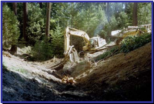
Stream restoration on the South Fork of the Trinity River.