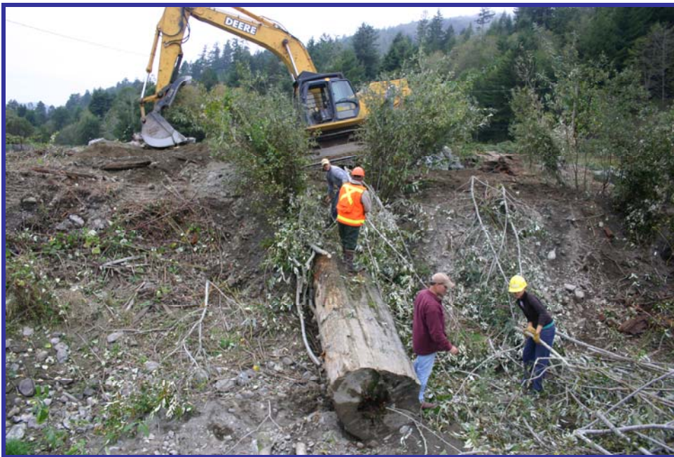
Using logs from decommissioned roads for floodplain bank recovery.