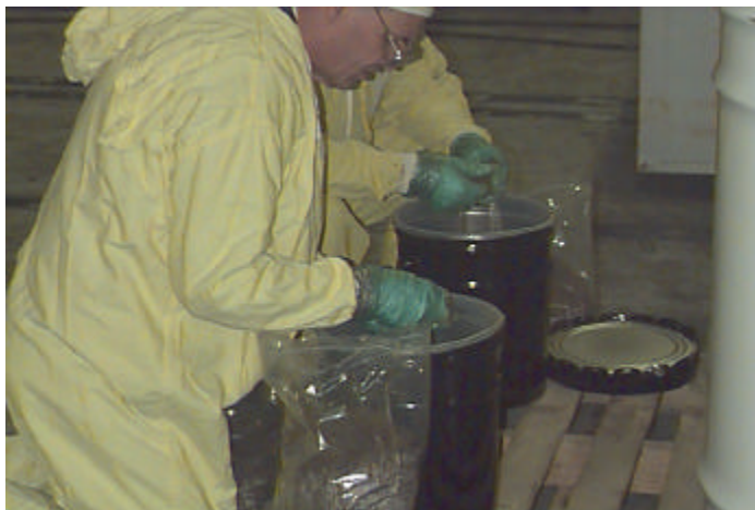
FIGURE 6-2: K-25 sampling personnel sift through the collected soil to remove rocks and other large debris.

Once the sifting was completed, the plastic liner was then removed from the container. To homogenize the soil sample, the liner was rolled on the ground in a back and forth motion, such the sample was kneaded and thoroughly mixed. Two 40-mL amber vials were fill with the homogenized soil for preliminary analytical characterization. A third sample was taken for total radiological activity screening. Paducah soil samples were collected at the site and shipped to ORNL for use in the demonstration.