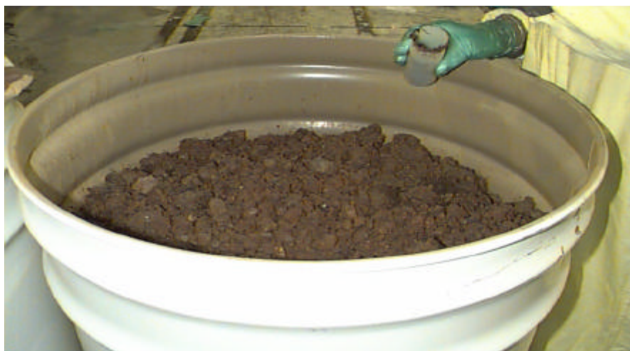
FIGURE 6-1: K-25 personnel acquire a PCB soil sample from a 55-gallon drum.

Soil was collected from the top of the drum and placed in a plastic bag. The soil was then sifted by hand to remove rocks and other large debris, and placed in a plastic-lined 5-gallon container. Figure 6-2 shows the samplers performing this procedure. The amount of soil collected half-filled the 5-gallon container, amounting to approximately 12 kg of soil.