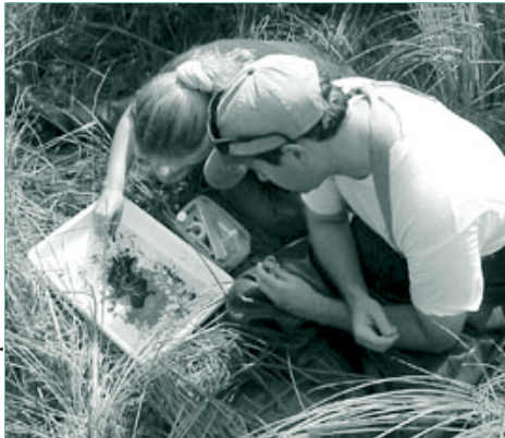
Scientists with the Maine Department of Environmental Protection sample macroinvertebrates to test wetland condition.