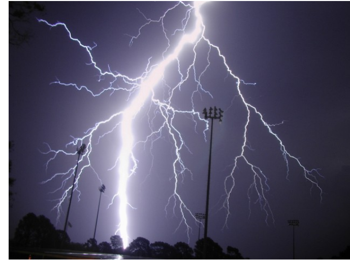
Lightning strikes over Northwestern State University Campus in Natchitoches, LA in April of 2006.

Lightning kills an average of 73 people each year in the US. That is more than hurricanes or tornadoes!