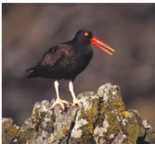
Black oystercatchers nest on islands in Glacier Bay National Park

The Dude Creek Critical Habitat Area 4 is one of the largest expanses of undisturbed wet meadow habitat in Southeast Alaska. This is an important resting spot for sandhill cranes during fall migration, when numbers at the refuge can reach into the thousands. Crane viewing is best in September, especially on clear, sunny days. The meadow provides cranes with an abundant food source and good places to roost with the ability to see predators at a distance. Other birds that use the area for part or all of the year include short-eared owls, Canada geese, Wilson's snipe,