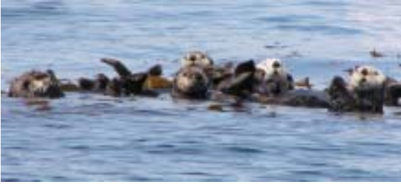
Sea otters are sometimes seen in groups, commonly called rafts, of two or more animals.

Be Considerate of Others. People use and enjoy Alaska's wildlife in a variety of ways. Respect private property and give hunters, anglers and others plenty of space.