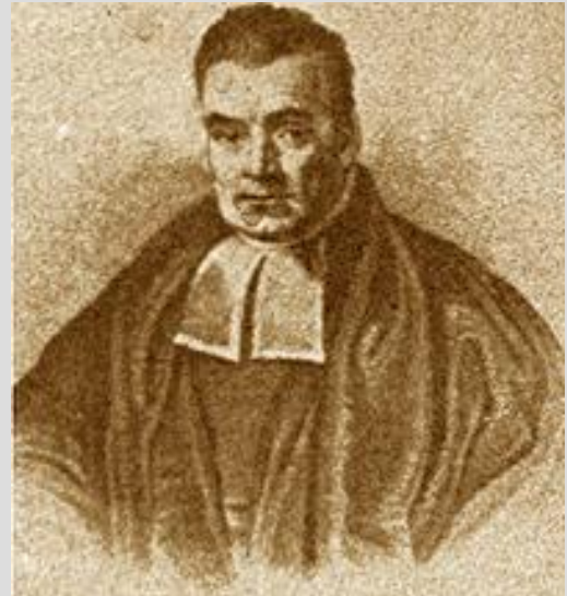
Rev. Thomas Bayes (1702-1761)

Transportation professionals seeking training or assistance with Bayes Analysis may contact the Resource Center Safety and Design TST.