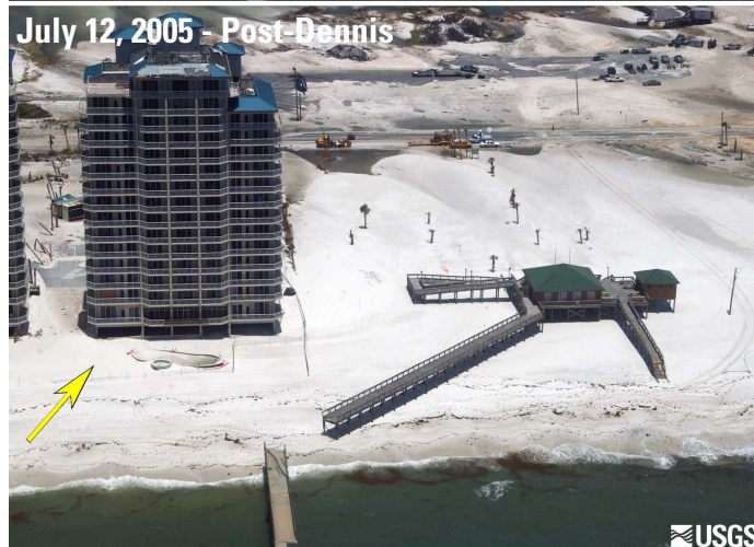
Figure 3. Navarre Beach, Florida. On this part of Navarre Beach, overwash deposits from Hurricane Dennis extend farther landward than overwash deposits from Hurricane Ivan. Deposits from both storms covered the two coast-parallel roads. (Arrows in all images point to the same features.)