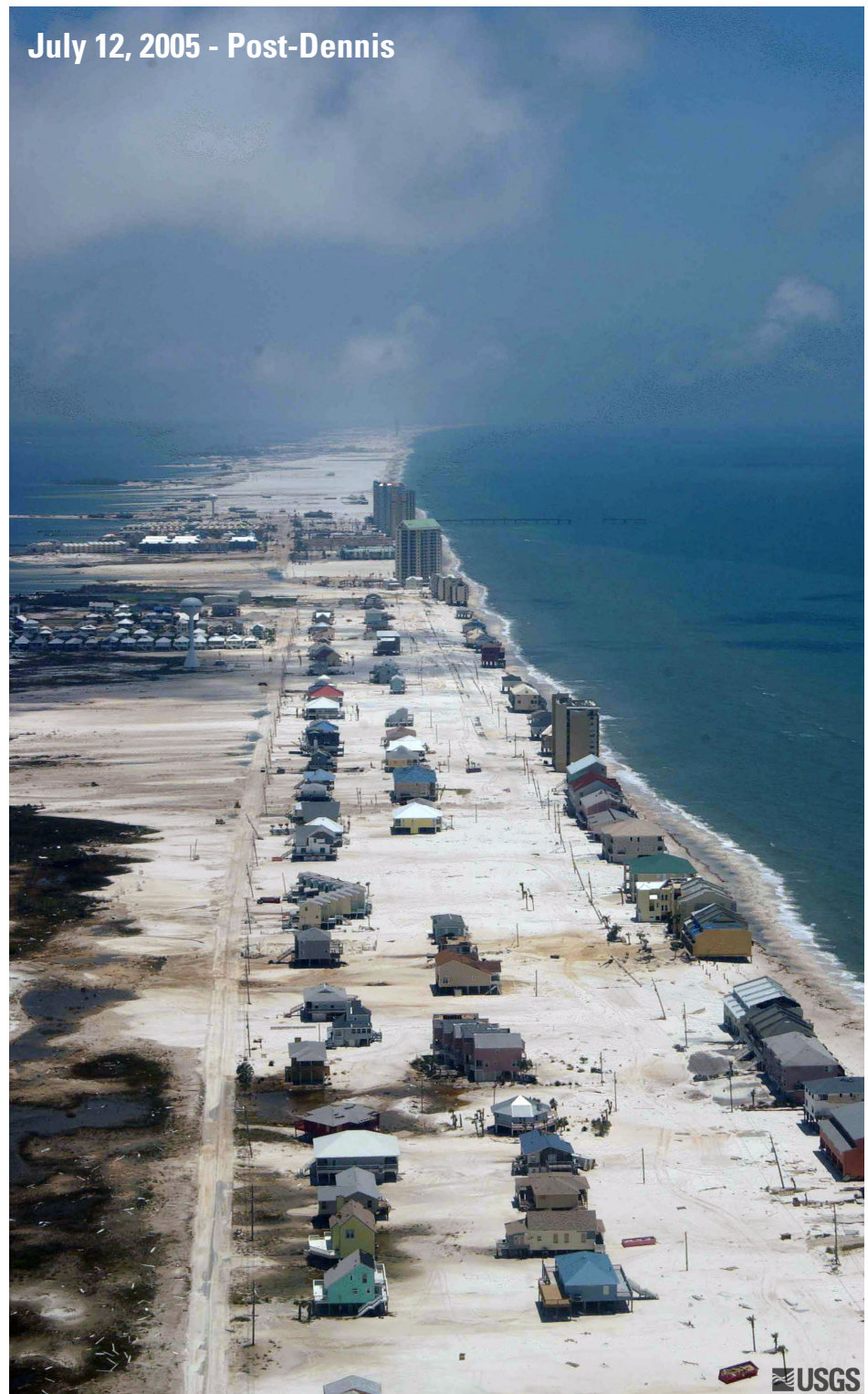
Figure 2. Santa Rosa Island, Florida, suffered severe erosion and overwash during Hurricane Dennis. Looking east, the magnitude of the overwash is evident. Overwash fans extend northward across the island, covering roads with sand eroded from the beach and dunes. In some cases, the overwash extends into the back bay.