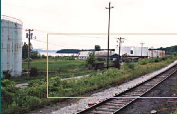
Prior to redevelopment, the banks of Lake Champlain were dotted with old oil tanks.