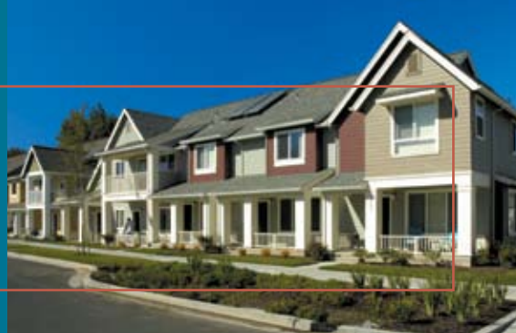
New Columbia's "green street" design, including 100 pocket swales helps reduce stormwater runoff.