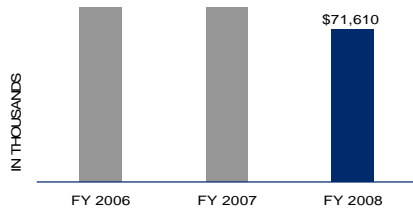
FY 2008 Budget Allocation by Objective