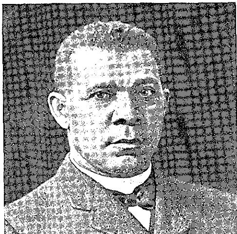
Booker T. Washington

original Burroughs plantation. Located here is a replica of the slave cabin similar to the one in which Booker was born. The spring from which Booker drew water continues to flow, and the catalpa and juniper trees that were growing when he was a boy still stand today.