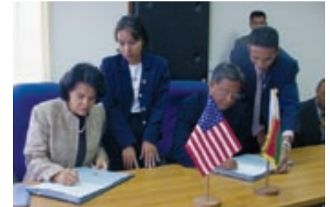
U.S. Ambassador to Madagascar Wanda L. Nesbitt (seated left) and Madagascar's Deputy Prime Minister Zaza Manitranga Ramandimbison (seated right) sign a USTDA grant agreement providing funds for a study on critical infrastructure upgrades at the Port of Mahajanga in Madagascar. The USTDA-funded study will focus on the development of a local and regional barge lightering system to enable cargo from larger ships to more efficiently transit the port.

At its core, trade is a function of the logistics and security infrastructure that support it. On this basis, USTDA made key investments during 2004 targeting transportation security and industrial investment projects in Africa and the Middle East.