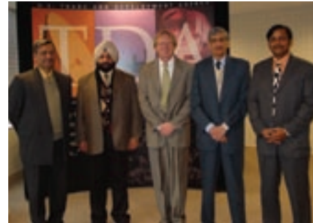
USTDA orientation visits bring key foreign decision makers to the United States to view U.S. technology that they can use to achieve their development goals. In early 2004, USTDA Assistant Director for Program and Policy Geoffrey Jackson met with delegates from India participating in an aviation security orientation visit.

• Orientation Visits: Orientation visits bring foreign project sponsors to the United States to observe the design, manufacture, demonstration, and operation of U.S. products