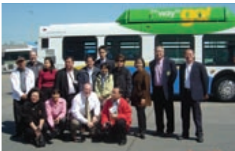
In 2004, USTDA sponsored a visit by transportation officials from Thailand (pictured here) involved in establishing a Natural Gas Vehicle Development Program to see how similar U.S. transit programs were implemented.

In addition to supporting specific projects, USTDA has funded activities designed to help countries establish the necessary regulatory framework for the development of the oil and gas sector. In East Timor, for instance, USTDA funded technical assistance on the establishment of a petroleum directorate to undertake fiscal and regulatory control of the oil and gas sector.