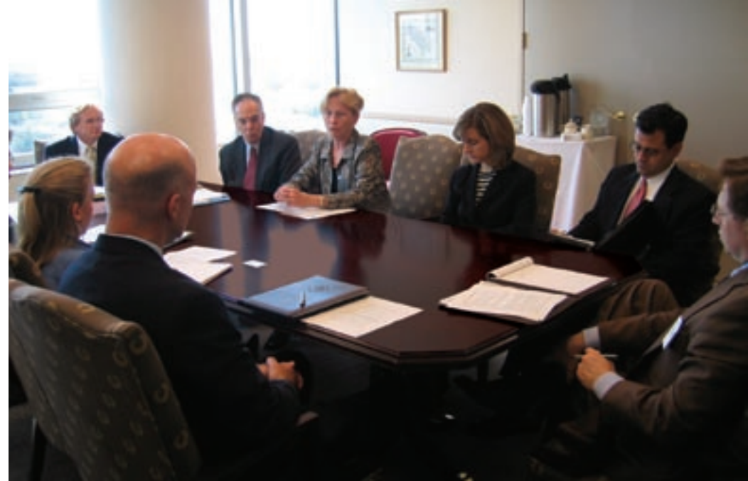
USTDA Director Askey speaks to inter-agency participants at the inaugural CIASS meeting in May.

The export multiplier ratio measures U.S. exports associated with foreign projects that USTDA has assisted relative to the amount invested in USTDA activities. Since its inception, USTDA-supported projects have generated over $22 billion in U.S. exports. Over the last decade, USTDA data shows the agency's projects have resulted in U.S. companies exporting more than $36 for every $1 of USTDA funds invested.