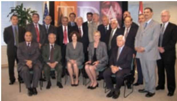
Orientation visits were a focus of USTDA's program in Iraq during FY 2004. Pictured above are the U.S. and Iraqi participants in an orientation visit on the reconstruction and modernization of Iraq's private banking sector.

RECOGNIZING THE POTENTIAL FOR POST-CONFLICT STATES TO BECOME LAUNCH PADS FOR TERRORISM, DRUG TRAFFICKING AND OTHER THREATS TO U.S. NATIONAL INTERESTS, USTDA IS INCREASINGLY ENGAGED IN RECONSTRUCTION EFFORTS. BUILDING ON ITS EXTENSIVE EXPERIENCE IN THIS FIELD, INITIALLY IN THE BALKANS IN THE 1990S AND SINCE 2002 IN AFGHANISTAN, THE AGENCY INAUGURATED ITS PROGRAM IN IRAQ DURING 2004 AND EXPANDED ITS ACTIVITIES IN AFGHANISTAN. IN FACT, USTDA COMMITTED MORE THAN HALF OF ITS 2004 EURASIA REGIONAL PROGRAM FUNDS TO PROJECTS IN THESE TWO KEY COUNTRIES.