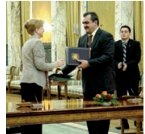
USTDA Director Askey (left) and Romanian Minister of Transport, Construction and Tourism Miron Tudor Mitrea (center) signed a USTDA grant agreement to help Romania achieve higher rail safety standards and increase its rail capacity through the completion of a study on the implementation of a satellite-based train control system.

USTDA's country strategies are derived from coordination with host country economic leaders, both private and public. Priorities vary from country to country and the level of assistance provided depends on budgetary resources, the developing country's commitment to trade reform, U.S. commercial and national security interests, and the agency's