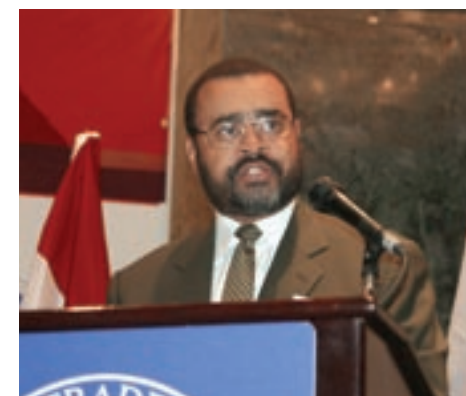
Deputy Commissioner of Customs and Border Protection at the U.S. Department of Homeland Security Douglas M. Browning addressed participants from Africa, the Middle East, and South Asia at USTDA's Secure Trade Through New Partnerships and New Technologies conference in February.

Supply-chain security is a related aspect of transportation systems that is vital in today's global economy. The threat of terrorism makes it equally important that trade mechanisms be secure, and provide for effective monitoring. These improvements make good business sense as well, given the quickening pace of decision-making and manufacturing and sales needs. USTDA funded a pilot project to enhance supply chain security and efficiency between seaports in Southern Africa and the United Kingdom and the United States as an outcome of the success of a USTDA-sponsored regional transportation security conference.