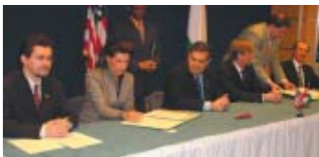
U.S. Secretary of Energy Spencer Abraham (seated center) looks on as U.S. Ambassador to Hungary Nancy Brinker signs as a witness to a USTDA grant agreement awarding funds to support a study on a wind farm project in Hungary.

Housing finance remains an area with great growth potential in the Europe region. In