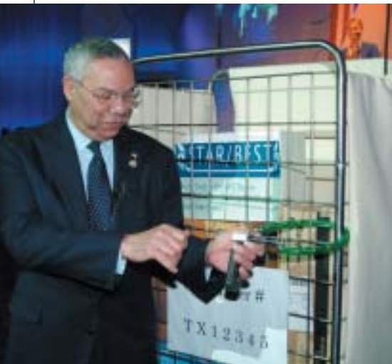
U.S. Secretary of State Colin Powell participated in a demonstration of the STAR-BEST project at the APEC CEO Summit meeting in Bangkok, Thailand in October 2003. Earlier in the year, USTDA awarded a grant to the Ministry of Foreign Affairs of Thailand to fund cost-benefit analysis related to the STAR-BEST project.

number of activities related to the Secure Trade in the APEC Region (STAR) Initiative . In particular, USTDA funded a regional STAR conference that brought together public and private sector representatives to identify solutions to regional security challenges. Recognizing the importance of security throughout the entire APEC region, USTDA is working with Thailand to advance supply chain security and trade