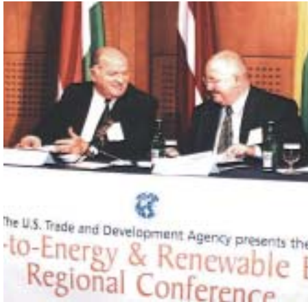
USTDA sponsored a Waste-to-Energy and Renewable Energy in FY 2003 highlighting over 20 projects in Central and Eastern Europe. Pictured here are members of a regulatory panel at the conference.

nations achieve their power needs, including projects such as the Al-Ibrahymia and Hofa Wind Power project in Jordan, the Biomass Generation Project in Ghana, and the East Africa Geothermal Conference . USTDA funding for coal bed methane development projects in India, China and Botswana promises to provide significant amounts of clean burning natural gas to these energy deficit countries.