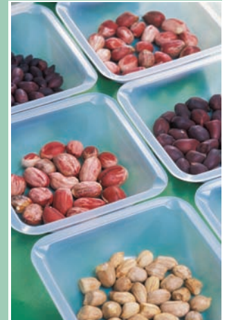
Genetic variability in seed color and size in cultivated peanut accessions maintained at Griffin, Georgia.