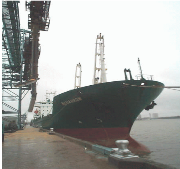
U.S.-flag vessel docking at a foreign port to deliver food assistance cargo. (Summer 2000)

The procedures for implementing those new funding responsibilities, to be administered principally by the Department of Transportation's Maritime Administration (MARAD) and the Department of Agriculture's Commodity Credit Corporation (CCC), were outlined in a 1987 Memorandum of Understanding 8 (MOU) signed by representatives of MARAD, CCC, and USAID. This MOU described procedures regarding the calculation, request, and payment of cargo preference reimbursements. According to the MOU, MARAD was to, upon submission and approval of agreed-upon documentation, reimburse CCC for the following two types of shipping costs: