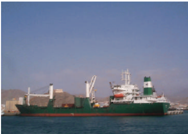
U.S.-flag vessel carrying 5,000mt of bulk corn from Beaumont, Texas to the Cape Verde Islands under USAID's P.L. 480 Title II program. (Summer 2000)

Each of the five food assistance programs described above is required by law to ship a certain percentage of tonnage on privately-owned U.S.-flag commercial vessels. This requirement, known as “cargo preference,” is found in the Merchant Marine Act of 1936 (the “Act”), as amended. The objective of this requirement is to help ensure that the United States maintains an adequate and viable merchant marine. From 1954 to 1985 the cargo preference requirement stipulated that at least 50 percent of certain U.S. Government-generated cargoes be shipped on U.S.-flag vessels. In 1985 Congress amended the Act to increase this requirement from 50 percent to 75 percent for commodities shipped under certain U.S. food assistance programs. At the same time, Congress directed that any increase in food assistance shipping costs under these programs, due to the application of this new cargo preference requirement, would be financed by the U.S. Department of Transportation.