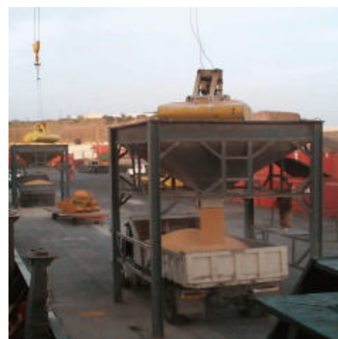
Unloading bulk corn from Beaumont, Texas, at port in the Cape Verde Islands. (Summer 2000)

The problem of missing documentation has been mitigated somewhat through recent aggressive efforts by CCC and USAID. For example, in February 2000, CCC and USAID personnel jointly identified processes that would accelerate the receipt of documentation necessary for filing more complete cargo preference reimbursement invoices. CCC initiated a tracking system that identified missing documentation by program and sponsor. Reports generated by that tracking system gave USAID additional information with which to better monitor the documentation submission performance of contracted freight forwarders. With this information, USAID has been able to improve the flow of required documents by directly contacting delinquent freight forwarders and, in one case, temporarily suspending a freight forwarder 14 for not submitting shipping documents in a timely manner. Through these combined efforts, as of February 2001, the number of delinquent completion packages had been reduced to 728 and were limited to two freight forwarders. According to CCC, both of the freight forwarders have