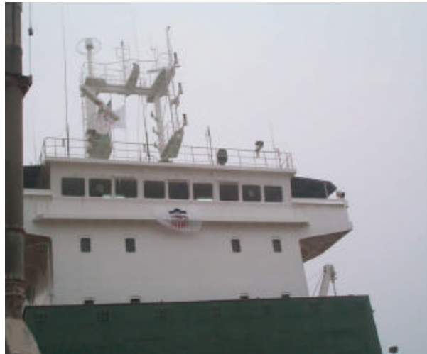
U.S.-flag ship carrying P.L. 480 Title II shipment and bearing the USAID emblem. (Summer 2000)

The MOU dictated that all CCC invoices to MARAD were to be submitted on a Standard Form 1081. 11 MARAD's responsibilities were to review the submissions, make adjustments if necessary, and send reimbursement payments to CCC. Although the MOU did not address what was to happen to the reimbursements once they reached CCC, the standard practice was for CCC to allocate the reimbursed funds by requesting that they be apportioned back to the programs from which they originated.