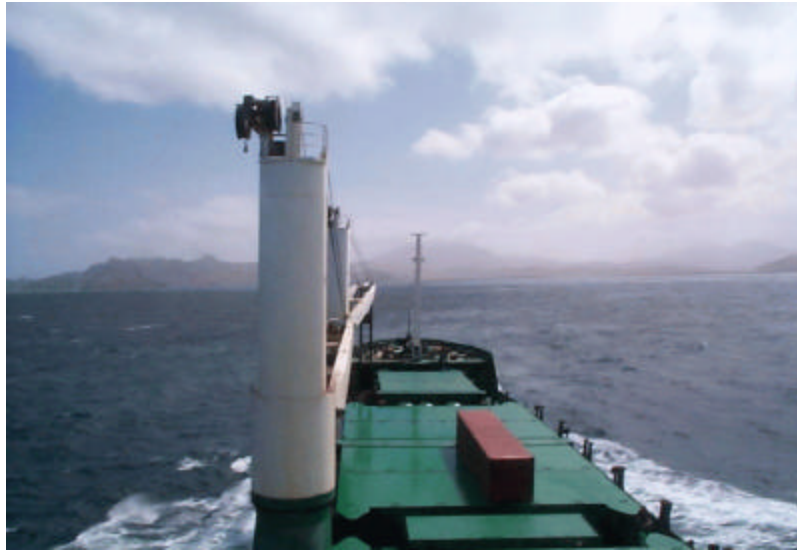
A U.S.-flag ship carrying P.L. 480 commodities to the Cape Verde Islands. (Summer 2000)

The MOU required MARAD to reimburse CCC for allowable shipping costs associated with incremental OFD and excess ocean freight costs. However, the MOU did not address how to treat any differences in requested versus actual reimbursements. Determining the causes of MARAD's adjustments to CCC invoiced amounts could possibly provide over $187 million in additional reimbursements for reprogramming, if those amounts turn out to be allowable and thus reimbursable costs. At a minimum, by reconciling the differences between requested and paid reimbursements, CCC might be able to account for the losses and avoid such losses in the future. Consequently, we believe that USAID should request that CCC reconcile the $187 million in rejected reimbursement requests and jointly establish procedures with CCC to follow-up/reconcile all such differences in the future.