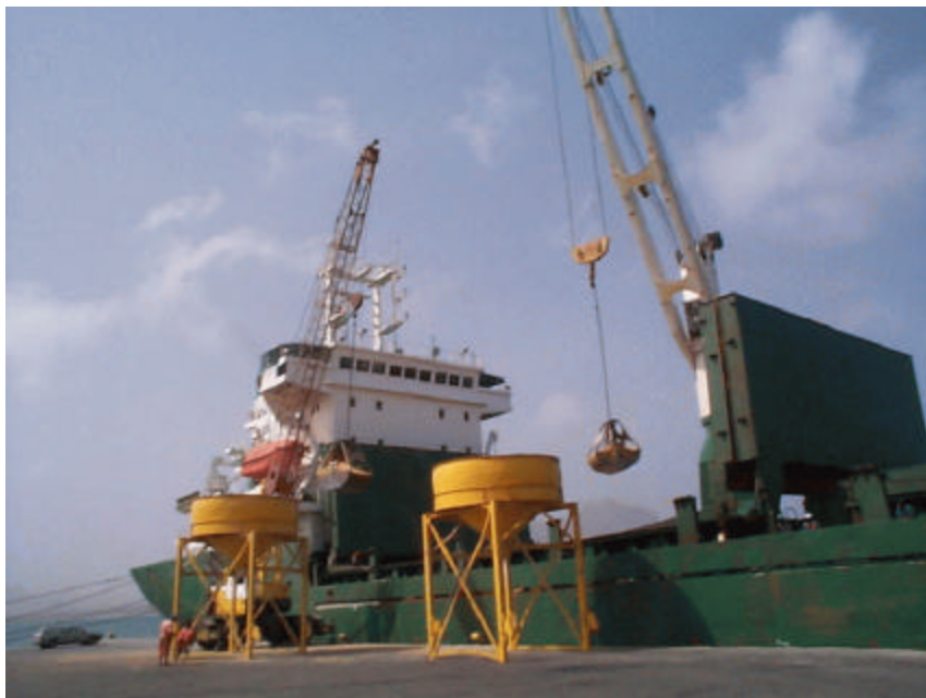
Cranes unloading bulk corn at port in Cape Verde Islands. (Summer 2000)

The following are some additional areas in which, we believe, changes to the procedures in the current MOU could improve the efficiency and effectiveness of the cargo preference reimbursement process.