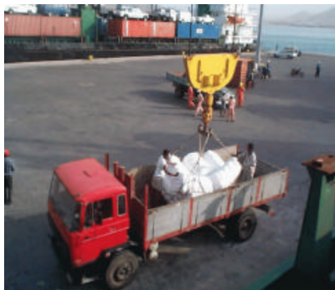
Unloading bagged commodities for in-land transport. (Summer 2000)