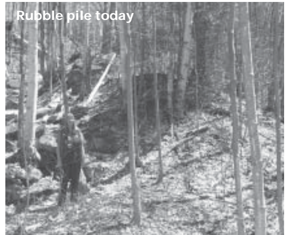
The blast furnace extracted iron from a mixture of ore, charcoal, and limestone. These ingredients are added at the top. The temperature is raised by the injection of an air blast. The less dense impurities float above the molten iron and are tapped off as slag. The molten iron sinks to the bottom of the furnace and is tapped off into moulds referred to as pigs, also known as pig iron.

Recipe for Pig Iron Pour 900 pounds iron ore 30 bushels of charcoal 155 pounds of limestone Inject hot air Boil at 800F (1500 C) Draw off slag Tap molten iron into damp sand casting room Yield: 1 Ton Ship via lake vessel