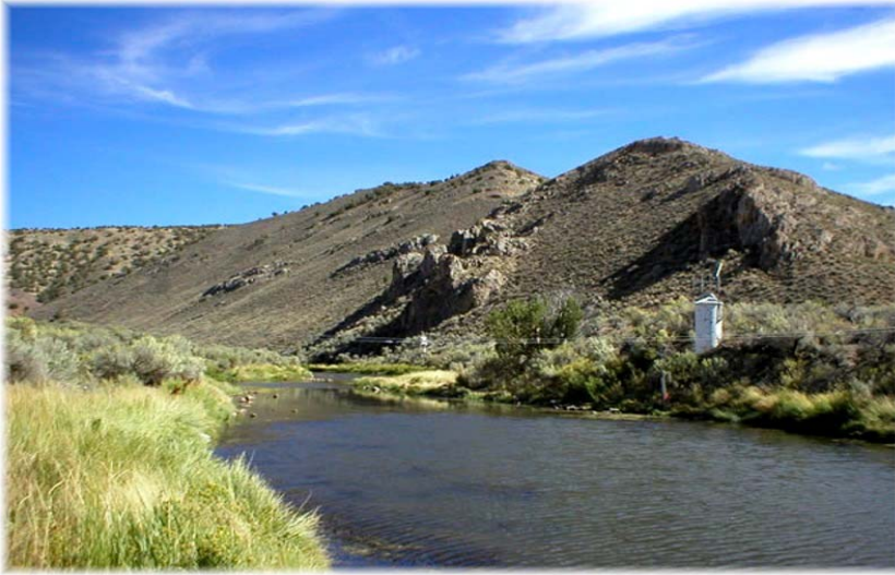
United States Geological Survey

The USGS is unique among public agencies in that it has provided high quality streamflow records to the nation for over 120 years.