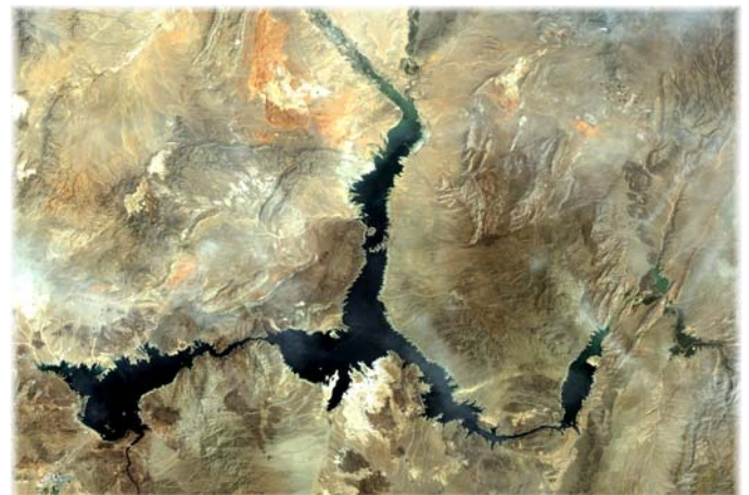
NASA — Earth Observatory

The benefits of adequate streamgaging data for floodplain mapping are direct and tangible. The benefits can be determined by reduction in flood loss. For example, a flood damages a home developed in a high-risk flood zone that is not mapped as a flood zone. The damages could have been reduced (or avoided) if the area was mapped correctly. The damages reduced or avoided are quantifiable.