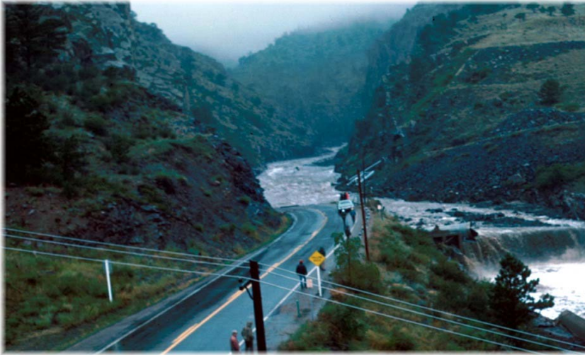
United States Geological Survey

scour or deposition will alter the stage-discharge relationship, which river forecasters must take into account.