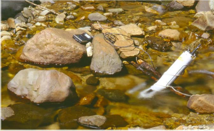
United States Geological Survey

Streamflow data are a primary requirement to further our understanding of hydrologic trends and changes in natural processes. The inherent variability in hydrology is an important factor in many research efforts. Consistently measured, unbiased data allows researchers to model complex interactions between physical and natural systems.