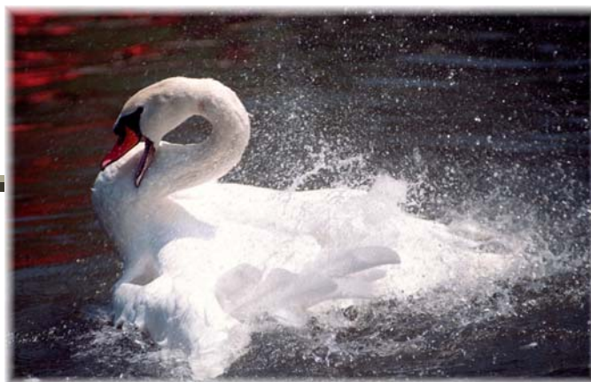
City of Overland Park — Public Works Department