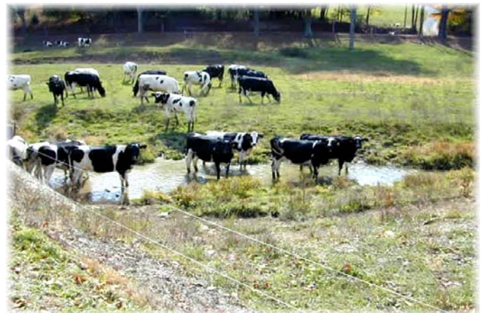
United States Geological Survey

The benefits of streamgaging data for protecting water quality provide direct and tangible benefits since it leads to proper design of facilities with associated costs that can be estimated. There are also indirect tangible benefits in that increased certainty in the information available to establish basin water management plans could avoid costly plan revisions and approvals from regulatory agencies.