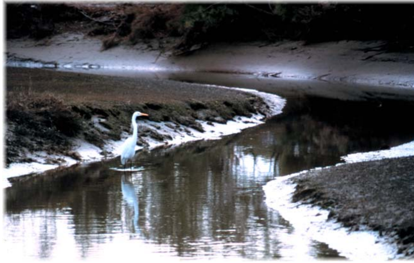
National Oceanic and Atmospheric Administration