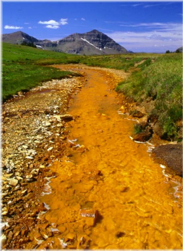
United States Geological Survey

Streamflow data are essential for making water quality assessments of chemical and biological constituents. Causes of impaired water quality can be categorized as: sediment and siltation, pathogens, metals, nutrients, and organic enrichment. Many inorganic and organic species such as pesticides and heavy metals are attached to suspended clays and organic matter in the rivers.