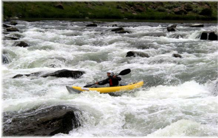
United States Geological Survey

Recreational users of streamflow data are a rapidly growing category of users. The USGS effort to add real-time data transmission capability from their gage sites has made it possible for many recreationists and water recreation businesses to monitor stream conditions and plan recreation outings.