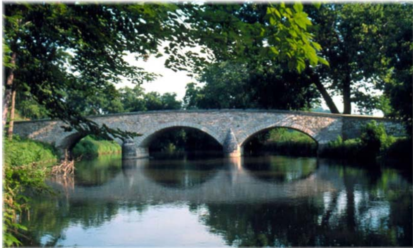
National Park Service