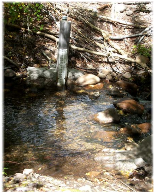
United States Geological Survey

While this report and other evaluations have focused on primary users of the data, particularly the entities who have an ongoing need for the data and contribute funding to operating and maintaining gages, secondary users receive significant benefits from the data. Often, users have a one-time need for the data to answer a specific question or to design a specific structure. Many users will search for the best available or most representative flow data near their area of interest. Some will seek a gage record that includes a specific period of time or event of interest. These ad hoc uses are difficult to properly value, but produce additional benefits that can be quite large over the period of record.