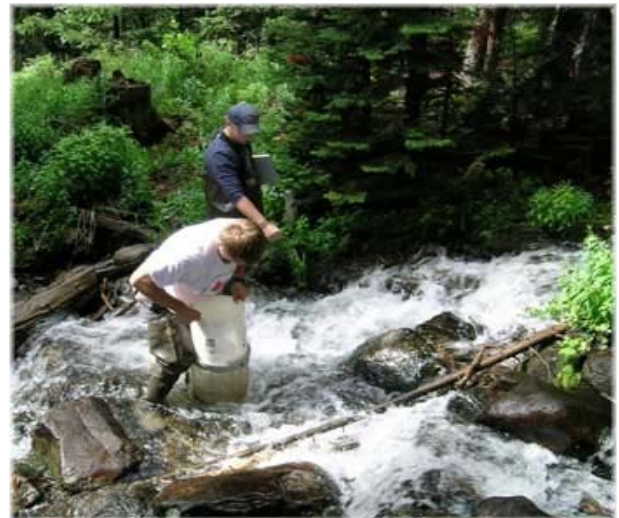
United States Geological Survey

The benefits of streamgaging data for educational and research uses are largely indirect and intangible. It is difficult to assign a value to advances in science.