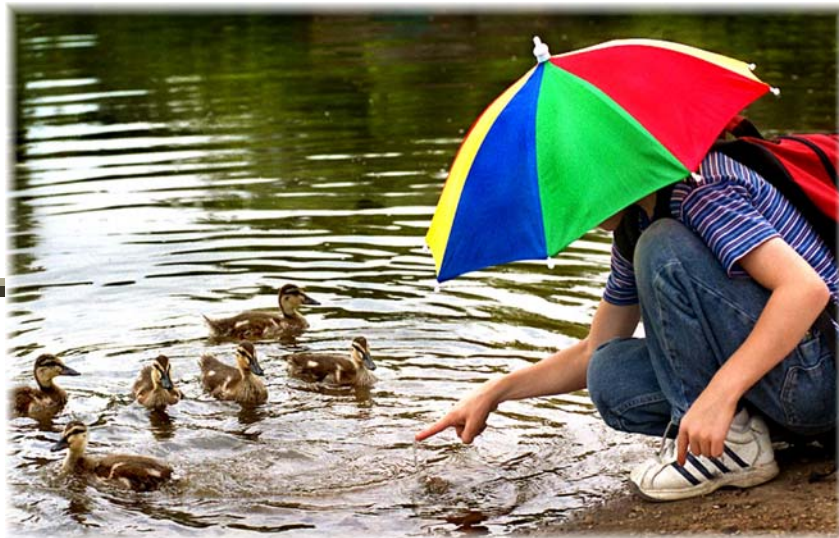
City of Overland Park — Public Works Department

These are described in the following sections.