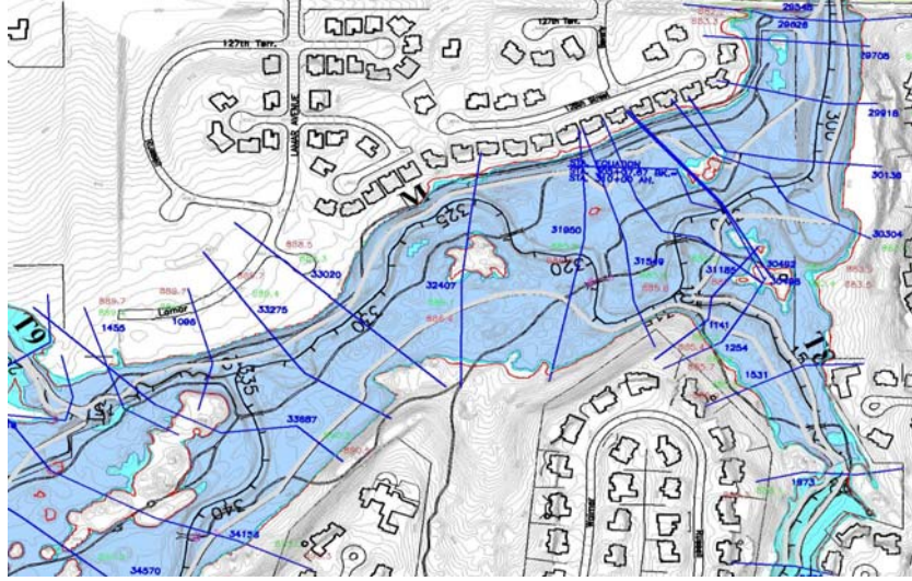
City of Overland Park — Public Works Department

Flood mapping studies are extremely important since the Federal Emergency Management Agency (FEMA) uses floodplain maps to establish flood risk zones and require flood insurance, through the National Flood Insurance Program (NFIP), for properties within the 100-year floodplain. Many areas subject to development in the near future are unmapped or have outdated maps. Preventing new development in floodplains, which reduces future flood damage, is the cornerstone of floodplain management.