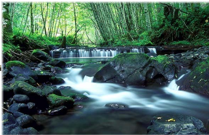
United States Geological Survey