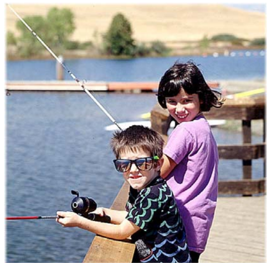
California Department of Water Resources

Benefits for recreational use of USGS streamgage data are, for the most part, direct intangible. For example, kayakers use data to determine when and where the best kayaking opportunities can be found. Recreational use can also have direct intangible benefits for recreation businesses using data to make decisions about safety. Commercial white-water businesses receive direct tangible benefits when they use the information to plan their operations and schedule their excursions.