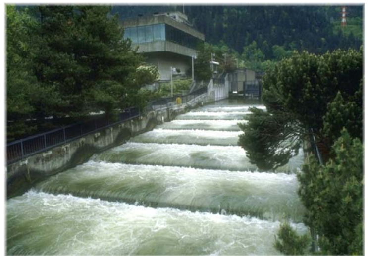
United States Army Corps of Engineers

The benefits of streamgaging data for environmental monitoring are largely indirect and intangible. Much is yet to be learned about the timing and flow thresholds that are optimal for aquatic species, so the benefits cannot be measured directly.