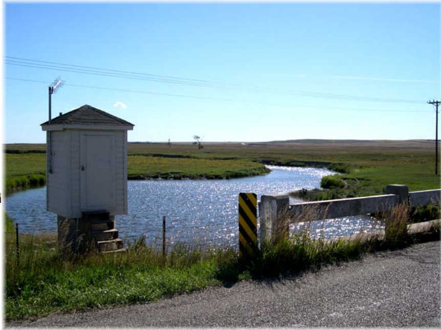
National Oceanic and Atmospheric Administration