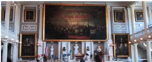
Grand Hall at Faneuil Hall, Boston, MA