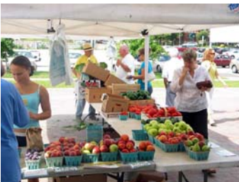
Farmer's Market, Shelton, CT

Want a quick link to the Brownfields web sites of the various New England state governments, to see what's happening there? Click CT , MA , ME , NH , RI , or VT !