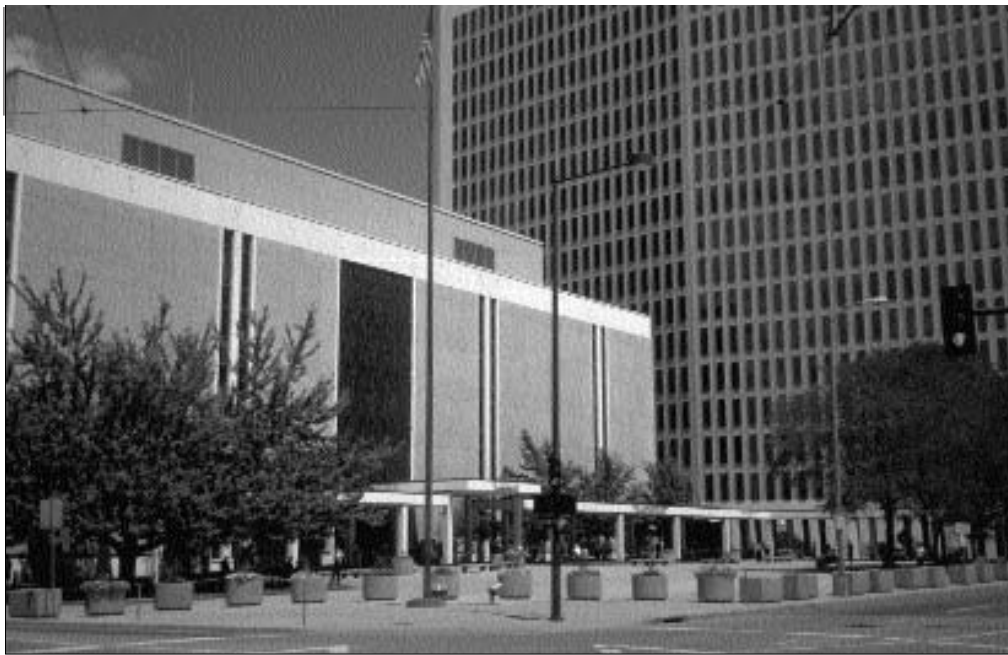
The plaza at the Rogers complex before renovations began

a friendlier place for federal workers and people visiting federal facilities, and a catalyst for further public and private investment.