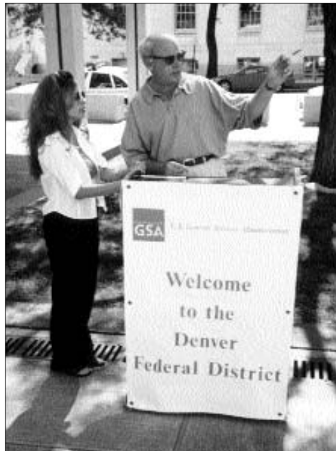
An ambassador stationed on the Byron Rogers plaza helps make the Federal District a more welcoming place.

The planning group is also enlisting nearby property owners in support of the plan's goals. The owner of the Denver Center, an inward-oriented office and shopping complex behind the Byron White Courthouse, brainstormed at one workshop about entry and facade improvements that might help his retail tenants. Qwest (the regional telephone company), which owns an eleven-story garage that faces the Customs House, has responded positively to a workshop suggestion about sprucing up the parking deck's dreary facade, perhaps with special banners or scrims that promote civic and cultural occasions.