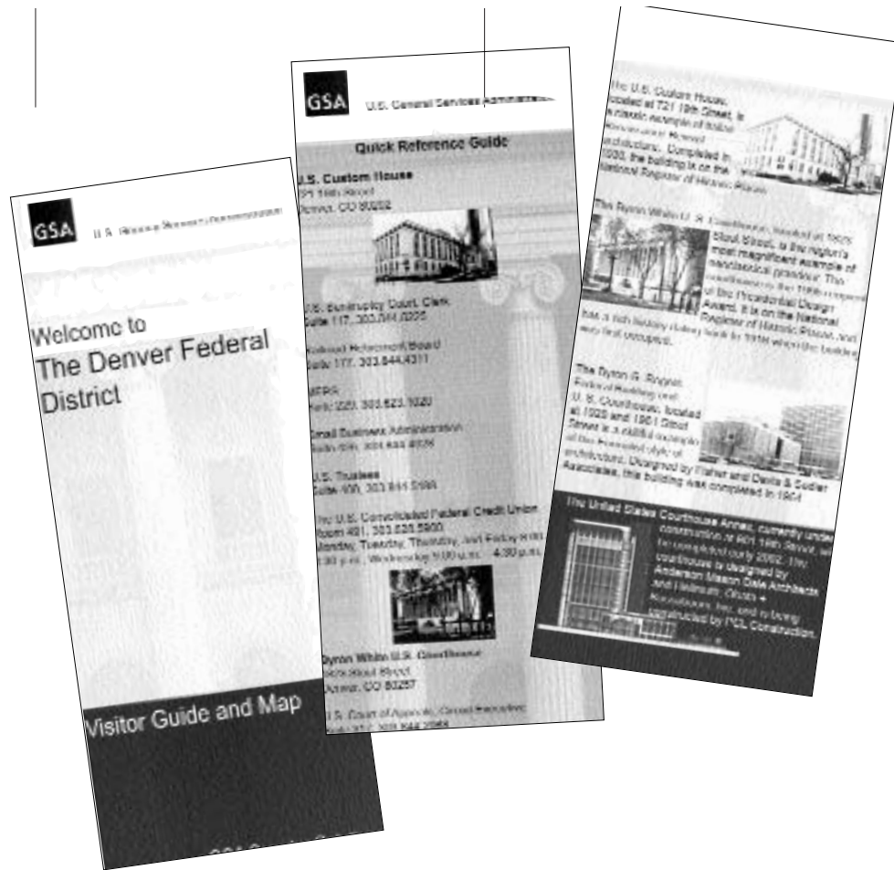
A brochure explains how to get around the Federal District, and the history of the architecture.

planning to contract for continued services from its Federal District Ambassador, who will also be responsible for organizing events on the Rogers complex plaza.