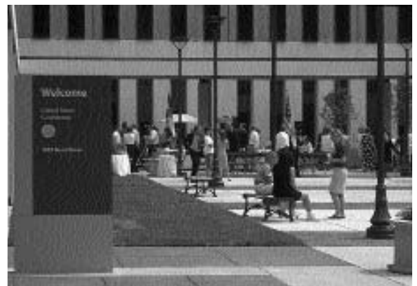
The newly renovated plaza at the Byron G. Rogers Federal Building and U.S. Courthouse in Denver's Federal Center