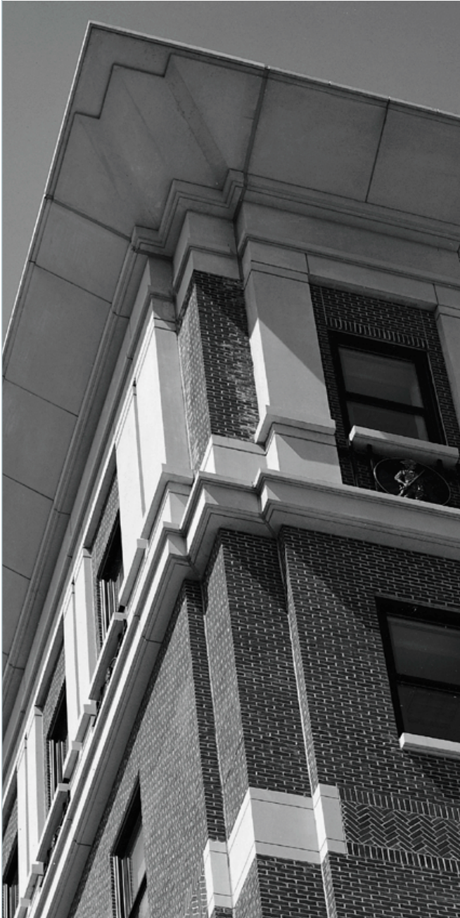
White Plains Courthouse