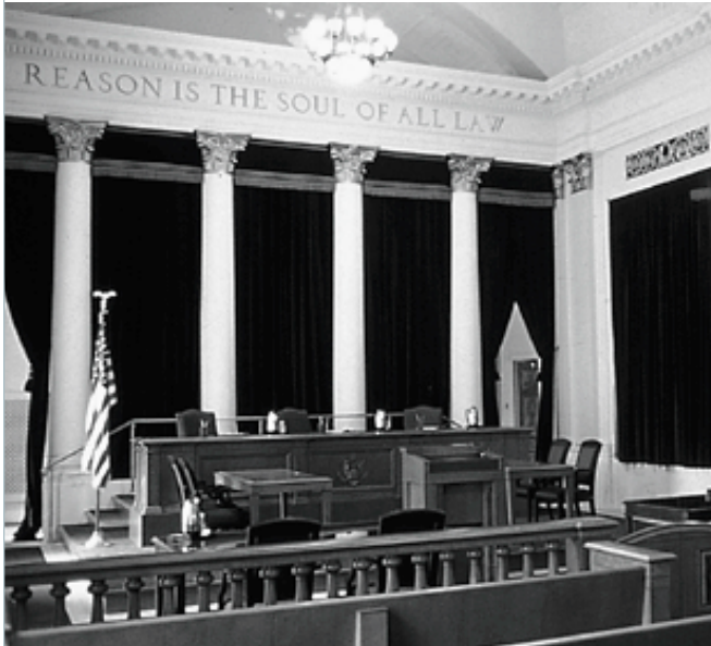
Byron White Courthouse, Denver, CO