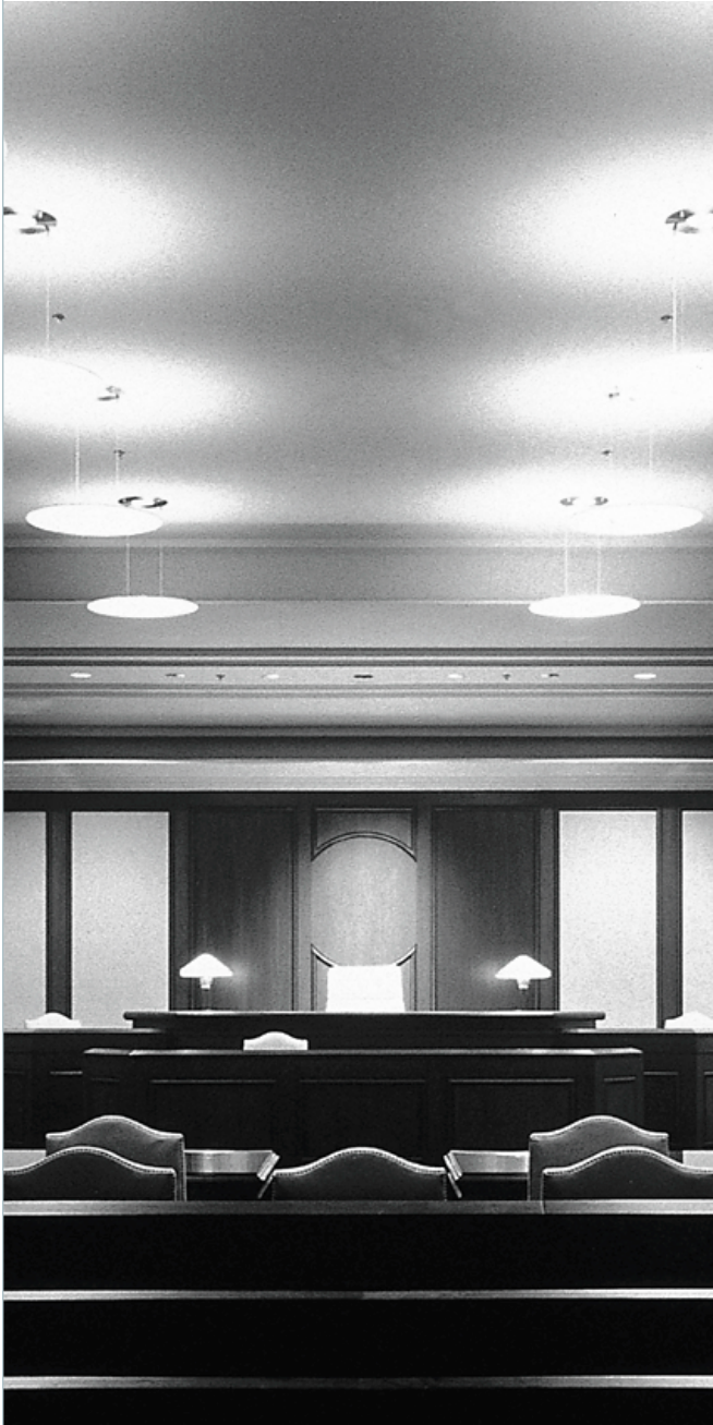
Robert C. Byrd Courthouse, Charleston, WV