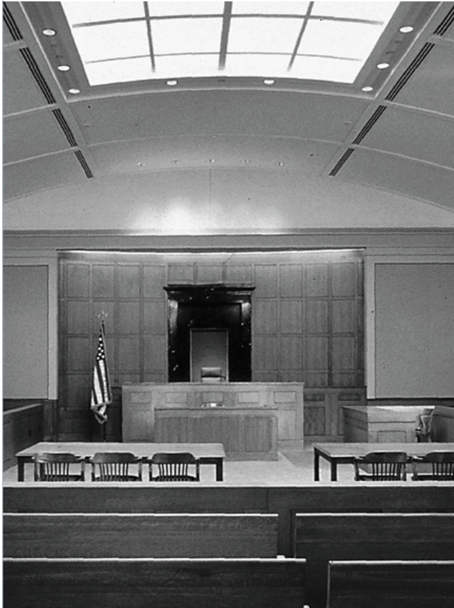
Harold D. Donohue Federal Building and U.S. Courthouse, Worcester, MA

Since U.S. Court facilities should be expected to have a long useful life, new construction and renovation projects need to be planned to provide adequate mechanical and electrical capability to the site and building(s) to support future additions. It is particularly important to design the systems for specialized areas of the building (lobby, food service, mechanical rooms, electrical rooms) to support