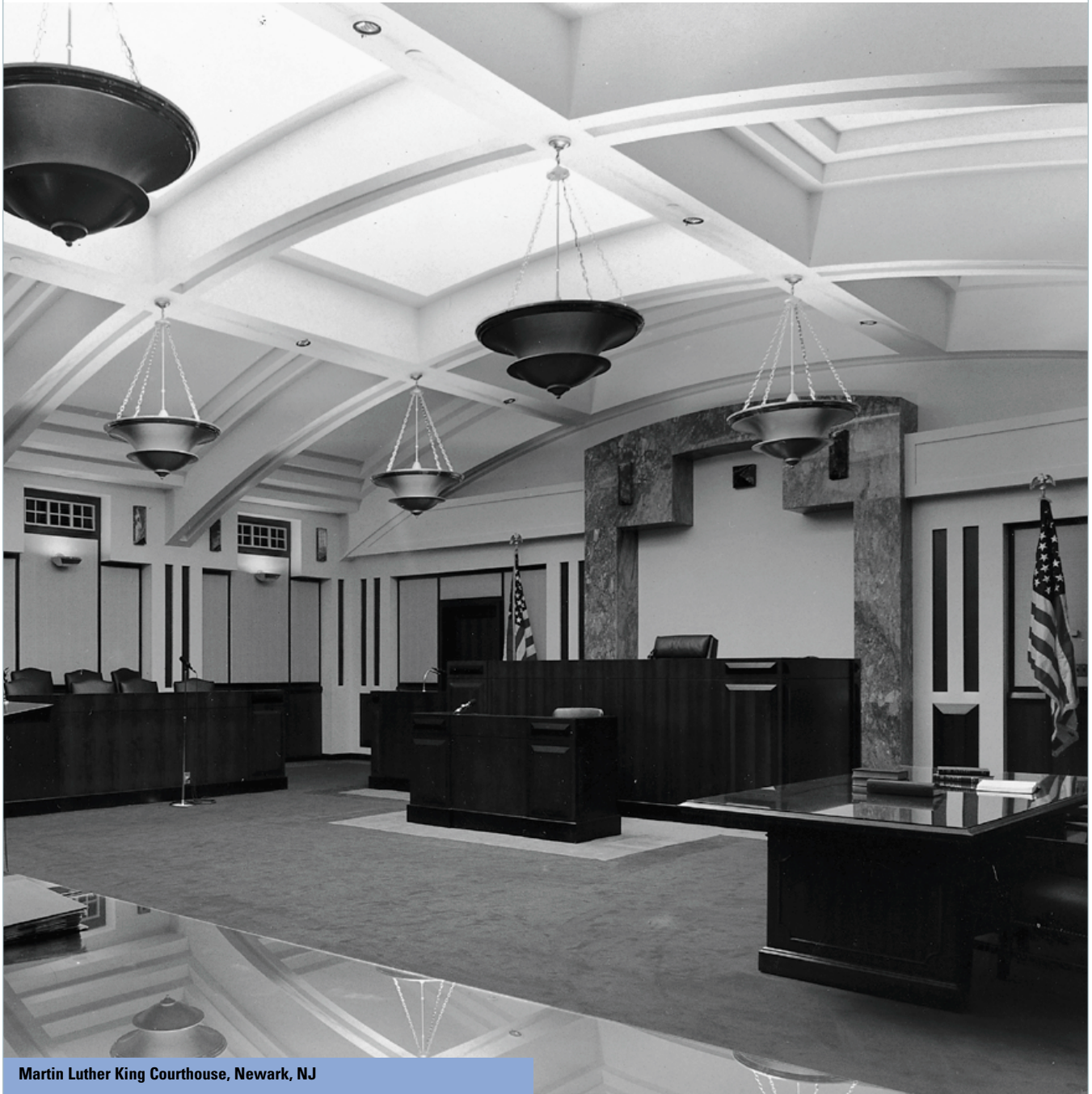
Martin Luther King Courthouse, Newark, NJ