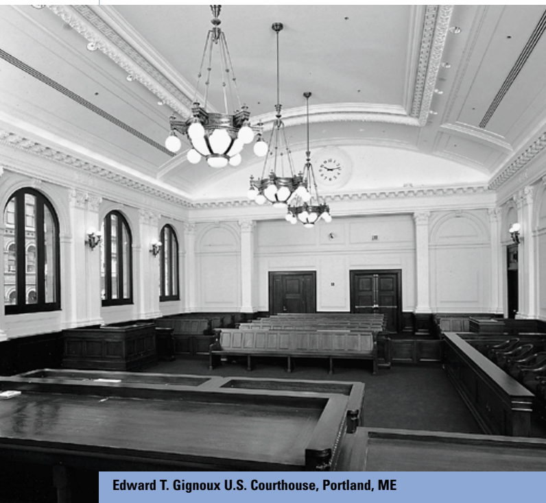
Edward T. Gignoux U.S. Courthouse, Portland, ME

To control noise during all modes of operation and for all load conditions, the HVAC system should be provided with one or more of the following: