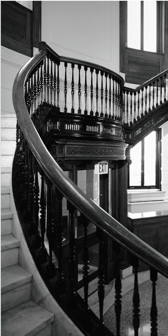
Edward T. Gignoux U.S. Courthouse, Portland, ME