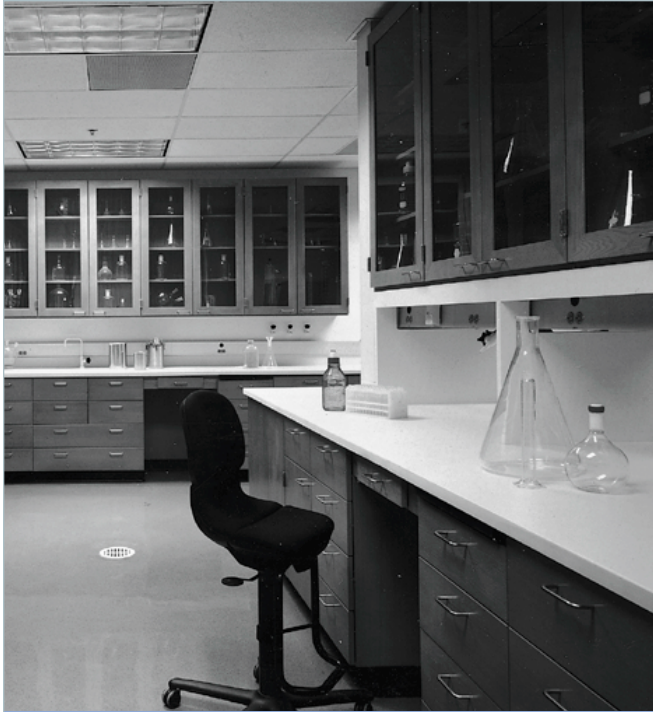
Vincent E. McKelvey Federal Building laboratory wing, Menlo Park, CA