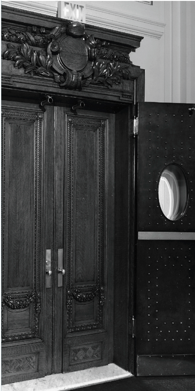
Spokane Federal Building