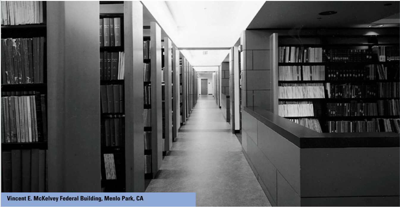
Vincent E. McKelvey Federal Building, Menlo Park, CA

Track Files. A track file uses a single aisle to give access to an otherwise solid group of open-shelf files. Access is gained by moving shelf units on rollers along a track until the proper unit is exposed.