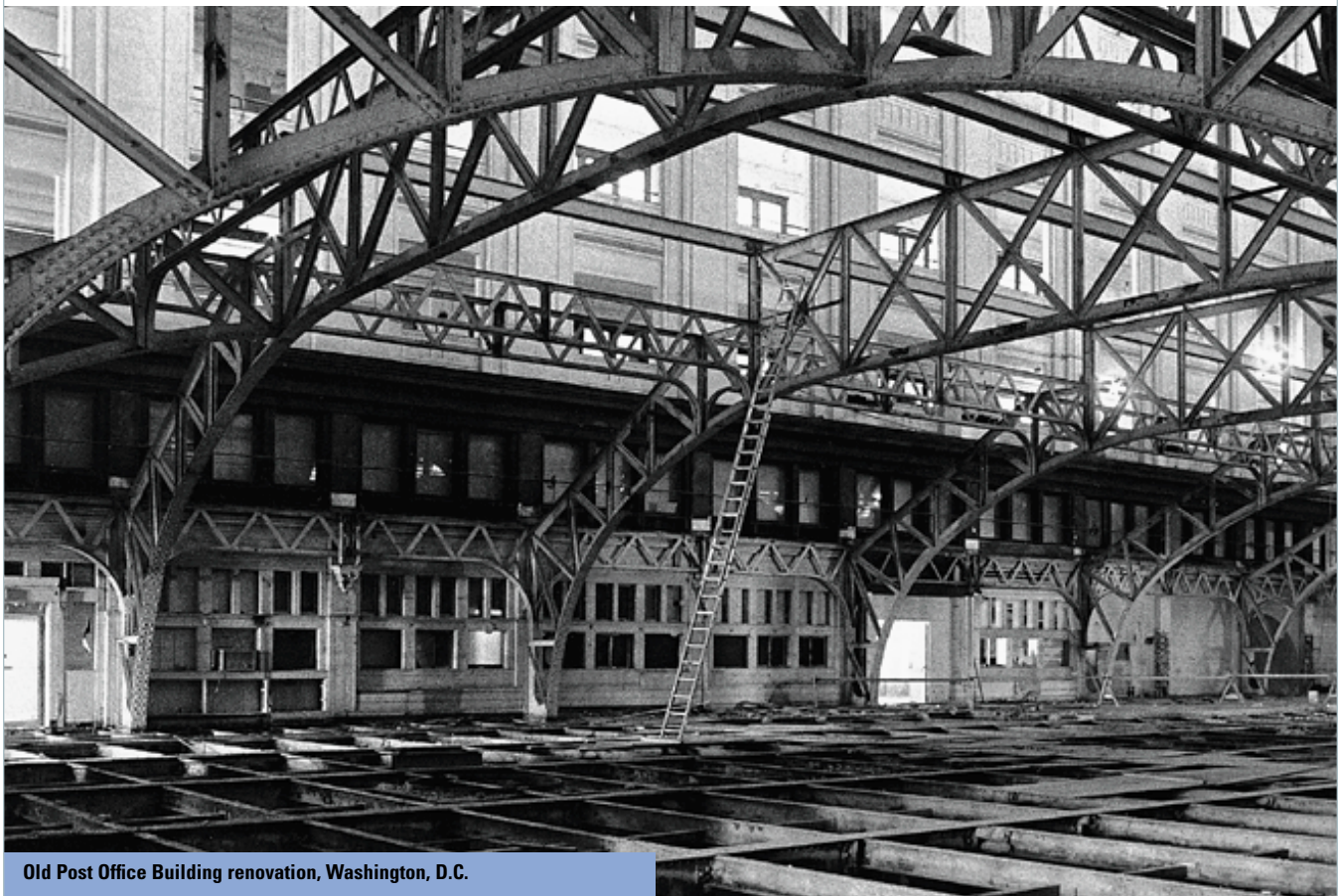
Old Post Office Building renovation, Washington, D.C.

Delineate phasing of construction to ensure that installations of new systems are expedited, and existing systems are kept in service until the replacement system is operational. If fire protection systems are to be disrupted, procedures shall be incorporated into the design to maintain equivalent levels of fire protection and provide formal notification to the facility while systems are down. For example, the provision of a 24 hour fire watch by qualified individuals may provide an equivalent level of fire protection during system disruption.