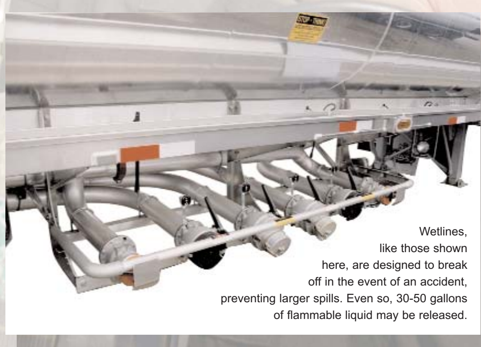
Wetlines, like those shown here, are designed to break off in the event of an accident, preventing larger spills. Even so, 30-50 gallons of flammable liquid may be released.

First responders should assume that wetlines contain flammable liquid when responding to incidents involving cargo tank vehicles, and take measures to limit exposure to the product during their response. Wetlines are designed to break off from the cargo tank during a collision yet leave the internal tank emergency valve operational to