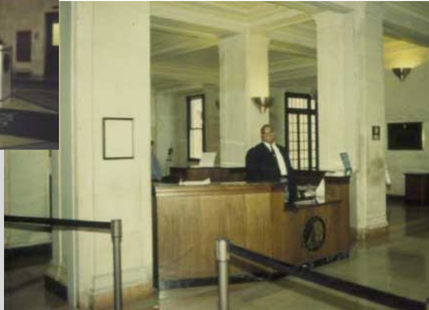
GSA Central Office, DC. New security desk, designed to complement historic surroundings.