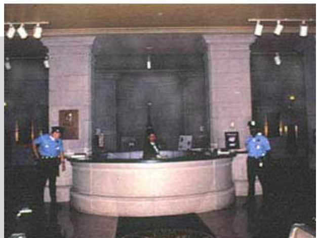
Fig. 2: National Archives, DC. Round security/information desk designed for round lobby space.