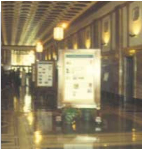
Fig. 7: Kinneary Courthouse, Cincinnati, OH. Original cases, salvaged from storage, display building history exhibit.

addition, use historic features as showcases. For example, abandoned directories can be effectively converted to house exhibits or interpretive displays (describing nearby artwork). (Fig. 7.)