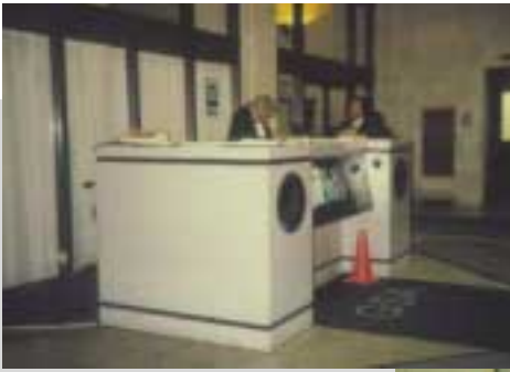
GSA Central Office, DC. Old security desk.