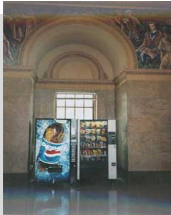
Fig. 4: Inappropriately placed vending machines in lobby obscure spatial configuration of space.

erally recommends sans serif typeface but serif is permitted as long as letter contrast and size is sufficient to ensure visibility. Attach signage systems in a manner that does not damage original finishes.(Fig. 5)