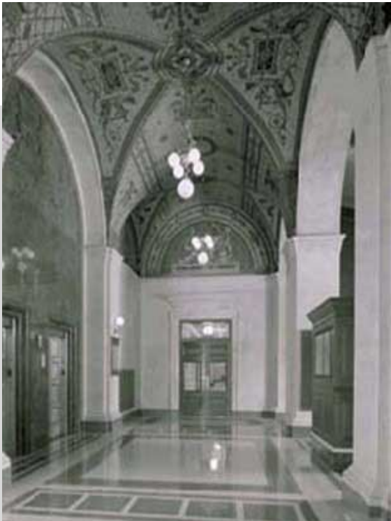
Fig. 3: Indianapolis, IN. Historic lighting in main corridor.