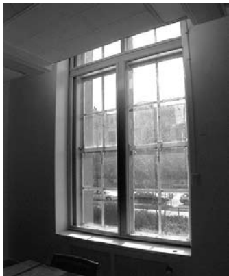
FIGURE 6 Interior views of blast-resistant storm windows. They are designed to contain flying debris, preserve the historic character of building exteriors and interiors, admit daylight, offer energy savings and, with operable product options, allow fresh air inside the building. (Oldcastle-Aral, Inc.)