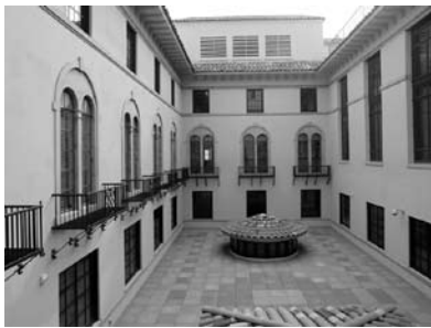
FIGURE 12 Thoughtful analysis to balance GSA preservation, cost, and performance goals supported historic window retention with replacement of non-historic windows at this 1930 courthouse. Blast-resistant, thermal storm windows were installed where original windows remained on courtrooms and the upper

When analysis strongly supports replacement of window sash or entire window units, consideration must also be given to the feasibility of a combination preservation and replacement approach that retains in place or relocates intact original windows to the building's facade and most significant elevations or visible locations (e.g. lower floor levels). As a Section 106 mitigation measure, some GSA projects have preserved sound original windows by consolidating them on the building's lower levels or replacing windows on secondary elevations only.