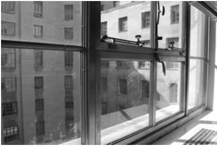
FIGURE 8 Detail views of historic windows retrofitted with laminated glass containing film to resist glass fragmentation and reduce heat gain.