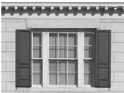
FIGURE 3 Exterior view of 19th century windows repaired and retrofitted with weather-stripping to reduce air infiltration. Properly maintained, some old growth wood sash windows have demonstrated life cycles exceeding 200 years.

Studies conducted by the Canadian government during the 1990s confirmed that the energy conservation benefits of installing weather-stripping and sealing gaps between walls, window frames, and sash to reduce infiltration offered greater operational savings in relation to dollars invested than any other window upgrade alternative, including installation of thermal replacement windows. Weather-stripping typically uses a thin, bendable strip of metal such as copper to fill the gap between the door or window sash and frame to exclude cold or unconditioned air. This energy conservation measure generally offers the best investment pay back, making it Public Works Canada's preferred alternative for improving the thermal performance of existing windows. Interior shades and blinds complement infiltration-reducing measures by controlling heat gain. Some products include sensor-driven operating mechanisms that respond to changing daylight conditions. These alternatives are regarded as maintenance repair, from a regulatory standpoint, and require no Section 106 review.