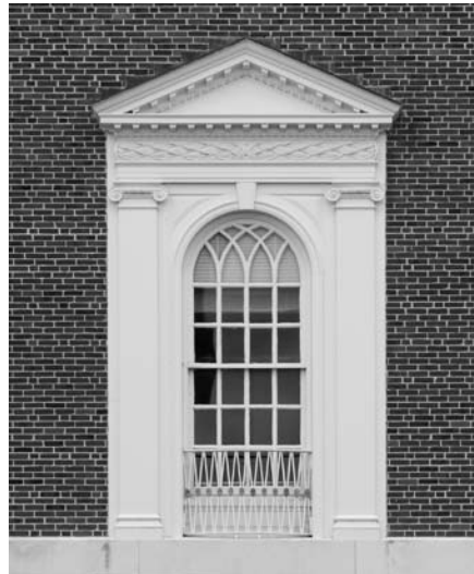
FIGURE 1 Windows are character-defining features in every historic public building. Stone quoins, Ionic pilasters and carved pediments frame multi-light, arched windows defining this Georgian revival facade.

Section 106 project submissions must include an illustrated Preservation Report with captioned photographs of existing conditions and a narrative summarizing the preservation design issues and options, with an assessment justifying GSA's planned approach. GSA's Window Project Matrix for Historic Buildings must also be included to justify any project proposals involving removal of historic windows.