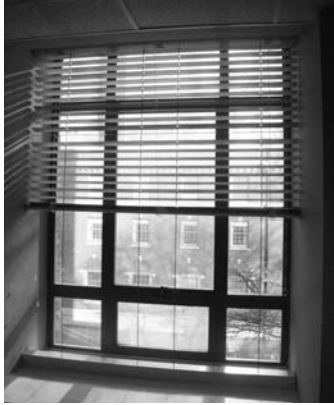
FIGURE 4 Used in conjunction with glazing film, blast blinds retain historic windows while providing improved thermal efficiency and blast protection. Supporting cables are anchored at the top and bottom of the window frame, so blinds can be opened and closed, not raised or lowered.

sub frame to absorb, rather than resist impact, much as a tree bends with the wind, then returns to its normal position. Large, fixed glass expanses common in modern-era buildings and multi-leaf doors not actively used can be secured using steel cables anchored into the building structure. Patented systems address a variety of facade configurations and are visible at close range, but are not noticeable from exterior grade level view.