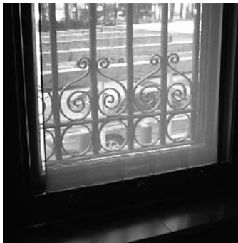
FIGURE 5 Blast shade detail showing fabric anchored to the window frame to contain glass fragments and sash units. Shades can be designed to conform to the contours of arched windows and other unusual openings.