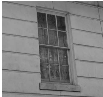
FIGURE 2 As part of every window assessment survey, the presence of rare, costly or difficult to replicate materials, such as the wavy crown glass reproduced for these mid-19th-century windows, must be identified as features requiring a window retrofit approach rather than replacement.

Any changes that will permanently alter or remove historic features or materials require a compelling justification supported by a systematic and building-specific analysis that takes into consideration preservation goals as well as window performance goals. The following sections review the principal retrofit and replacement options appropriate for GSA historic buildings.