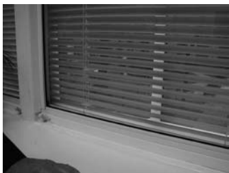
FIGURE 7 Detail views of demountable blast-resistant, thermal storm windows with built-in blinds to control daylight.

Some storm window products have size constraints that may require designing multiple storm windows with carefully aligned muntins for windows exceeding a given size threshold. The ability of the existing window frame to support added storm sash containing laminated glass must also be confirmed. Some frames will require structural reinforcement. Sash access for cleaning and maintenance must also be considered.