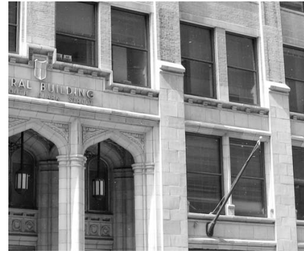
FIGURE 10 Exterior view of blast windows fabricated with custom muntin placing upper and lower panes in separate planes to simulate the appearance of double hung windows.