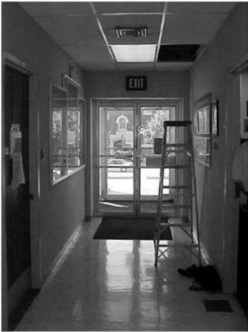
FIGURES 13-14 Before (top) and after (bottom) view of this courthouse entrance lobby illustrate how well designed HVAC systems contribute to positive first impressions and tenant satisfaction.

Large sites may be able to accommodate underground vaults to eliminate equipment visibility and simplify access for repair and replacement. As a last resort, enclose equipment that cannot be concealed in screening designed to blend visually with the facade or landscape, as appropriate.