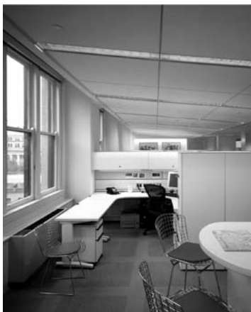
FIGURE 9 Recess, slope, or step ceilings to maintain window clearance.

daylight as deeply as possible into the building interior.