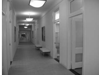
FIGURE 4 After: Relocating corridor ductwork to adjoining office spaces enabled GSA to restore previously concealed cove cornices and door transoms that now flood the corridor with welcomed daylight.