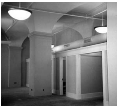
FIGURE 10 Thoughtfully exposed ductwork allows vaulted ceilings to remain exposed to view.

Installing exposed ductwork as part of a thoughtfully planned open ceiling, exposed system workspace design can help to mitigate the claustrophobic effect of inherently low ceilings and allow occupants in industrial buildings adapted for office use to enjoy the benefits of tall ceilings, clerestory windows, skylights, monitor windows and other industrial daylighting features.