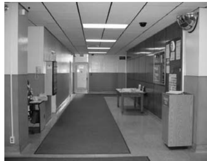
FIGURES 1-2 Thoughtful routing, configuration and concealment of ductwork plays a major role in the esthetic success of HVAC retrofitting projects at historic buildings.

Split systems can offer a low architectural impact solution for individual ornamental spaces where ventilation is provided by other sources and independent control is advantageous. Low visibility freestanding portable AC units offer another preservation-appropriate alternative for small ornamental spaces requiring supplemental cooling, where other options cannot meet the preservation and performance requirements of the space. Low profile window units are a simple and relatively unobtrusive option for small areas where units can be placed inconspicuously in spaces not easily served by other cooling solutions.