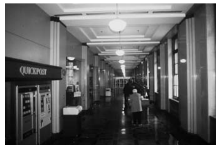
FIGURE 8 Ducts aligned with pilasters and flattened to read as shallow beams blend into historic ceilings.

Flatten ductwork or create architecturally integrated false beams to route ducts across corridors and large spaces. Ducts aligned with pilasters and flattened to read as shallow beams incorporated into plaster ceilings are another approach for blending ductwork into historic ceilings.