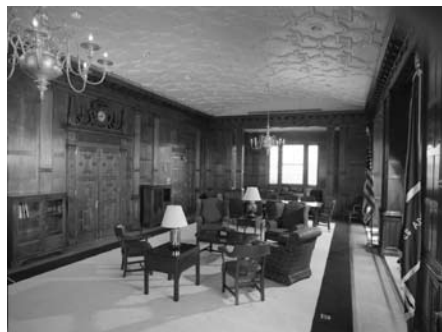
FIGURES 11-12 Linear diffusers located in the plaster walls at each end of this 1917 executive suite increase air supply volume and coverage, reducing the number of wall penetrations otherwise required for conventional grilles. Louvered grilles were confined to end bays and grain painted to blend with the room's paneled oak walls.

faux graining can be very effective in blending grilles and louvers into paneled walls.