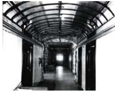
FIGURE 3 Before: GSA Building corridor ductwork installation in progress, 1935.

The first federal building to be air-conditioned was the U.S. Capitol, beginning in 1928. By the early 1930s, new offices built in the Federal Triangle were installing air conditioning systems. Air conditioning was added to GSA's Central Office Building (originally built for the Department of Interior) in 1935. Most federal buildings, however, were not retrofitted with central air conditioning systems until GSA established new facility standards in 1955, making HVAC installation standard practice for new federally funded office buildings. During the 1950s and 1960s, window air conditioning units were installed in many existing federal buildings as an interim climate control measure for improving tenant comfort. By the 1970s, advances in heating and cooling technology offered a greater range of technical choices, capabilities, and system flexibility to respond to varying needs and conditions --sometimes at the expense of reliability and manageable maintenance.