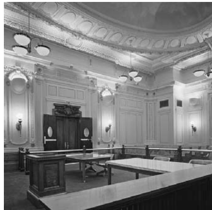
FIGURES 5-6 GSA Building Preservation Plans identify spaces of architectural importance and character-defining features to be preserved and restored, such as this hidden ornamental ceiling restored as part of the building systems upgrade.

GSA's PBS P100 Facility Standards provide the following guidance for HVAC improvements at GSA historic properties: