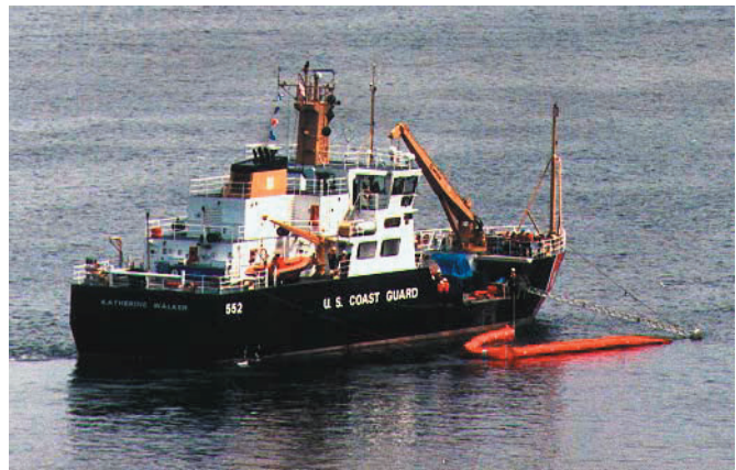
Coast Guard buoy tender deploys Spilled Oil Recovery System.