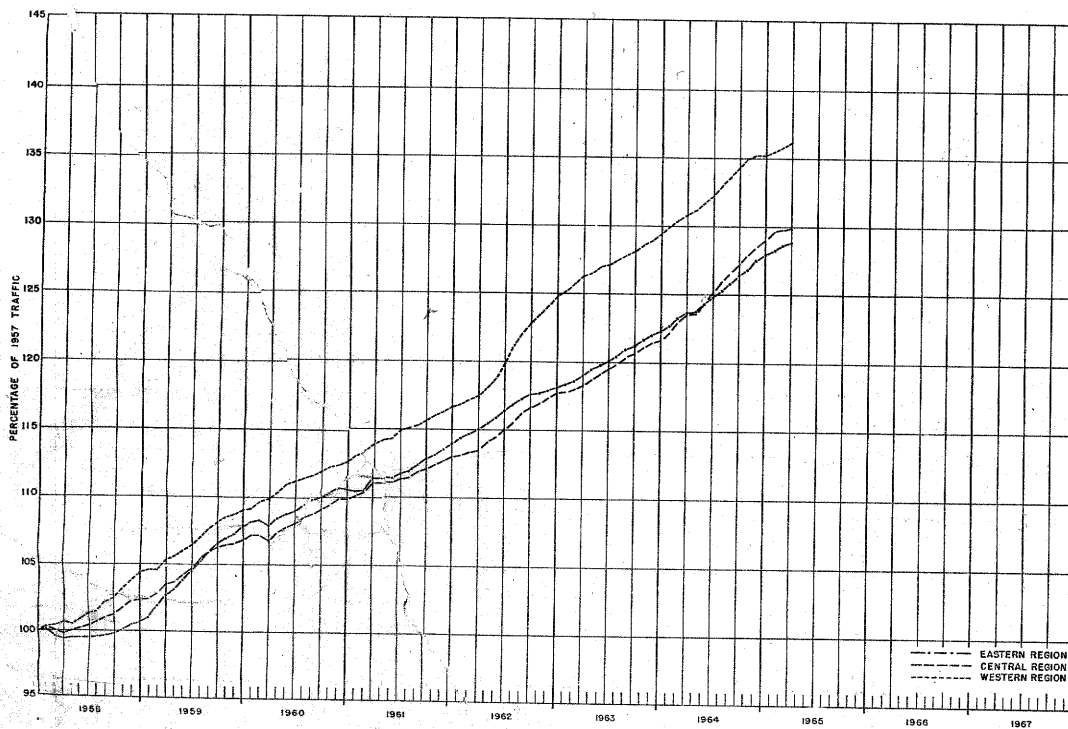
FIGURE 3--TRAVEL ON MAIN RURAL ROADS BY 12-MONTH PERIODS ENDING EACH MONTH, AS PERCENTAGE OF TRAFFIC IN THE CALENDAR YEAR 1957