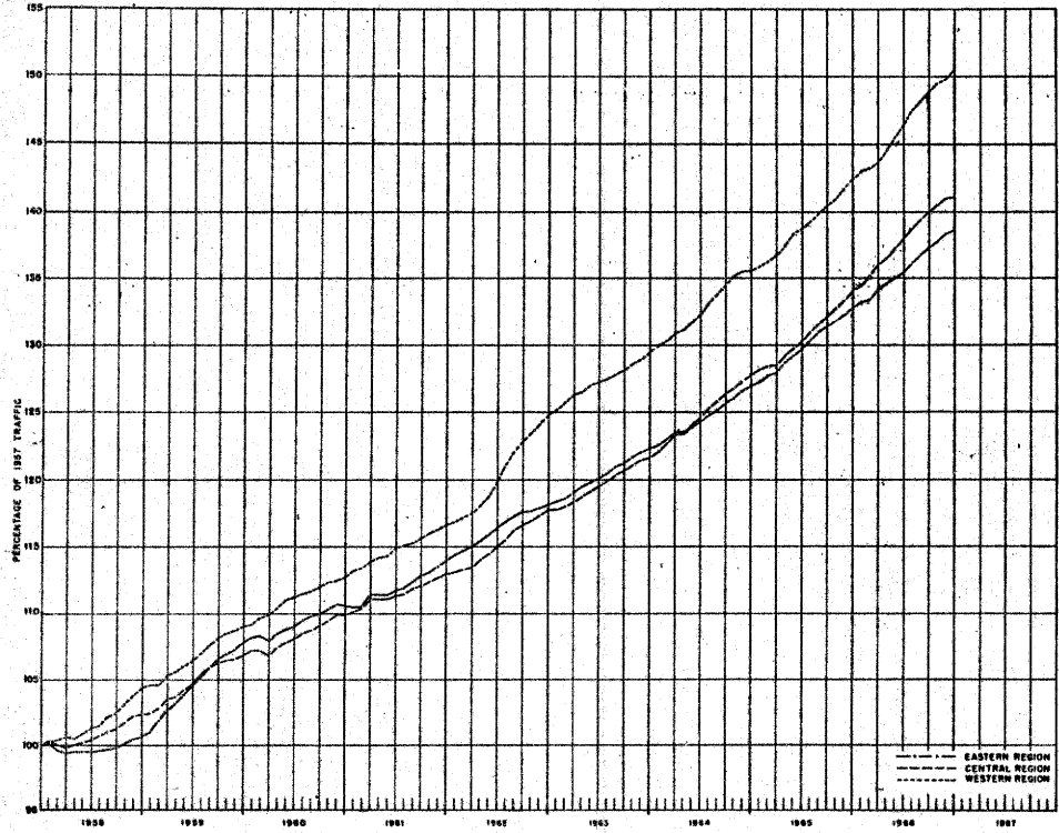
FIGURE 3--TRAVEL ON MAIN RURAL ROADS BY 12-MONTH PERIODS ENDING EACH MONTH, AS PERCENTAGE OF TRAFFIC IN THE CALENDAR YEAR 1957