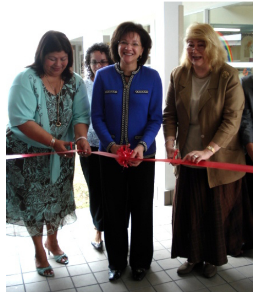
Pictured from left to right Adriana Irizarry - Government of Puerto Rico, Director, Office of Children and Families,

The original facility opened in January, 2002 accommodating 74 full day children, along with an after school program. With demand for quality child care far exceeding the supply, GSA undertook an expansion project that added approximately 4,300 square feet, including four (4) new classrooms and a teachers' lounge, to the original layout of six classrooms and an interior courtyard playground. The facility now accommodates 110 full day children and 10 children in the after-school program.