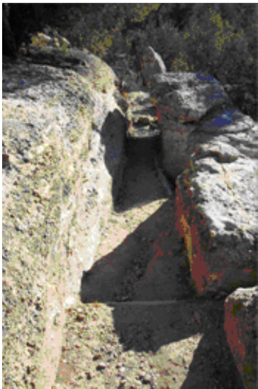
Burro Canyon Conglomerate along the Little Ruin Canyon Trail.

Despite the many deep and revealing canyons on Cajon Mesa, only two geologic formations are easily visible at Hovenweep. The earlier of these to be deposited was the Burro Canyon Formation laid down between 100 and 136 million years ago in the early Cretaceous period by a river and floodplain complex containing occasional small brackish ponds. It is composed of white conglomerate, green shale, mudrock, and sandstone layers with interspersed pebbles and cobbles of chert, silicified limestone, and quartzite. The Burro Canyon Conglomerate is easily seen at Cutthroat Castle and along the canyon crossing section of the Little Ruin Canyon trail. This conglomerate was an important source of material for tool production during ancestral Puebloan times. Also look for the green shale that can be seen along the upper portion of the Holly Trail.