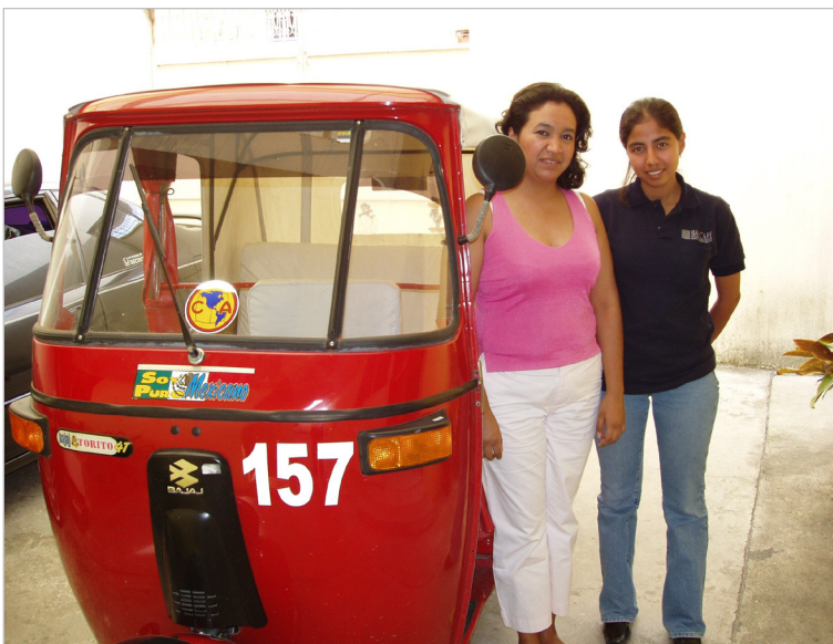
Photograph of a loan recipient and an official from a DCA financial institution. The proceeds were used by the borrower to expand her taxi business.

USAID/Guatemala did not clearly establish and track performance indicators for its three DCA guarantees as required by USAID's DCA Operations Manual. In fact, its Performance Monitoring Plan did not include indicators or targets for any of the guarantees.