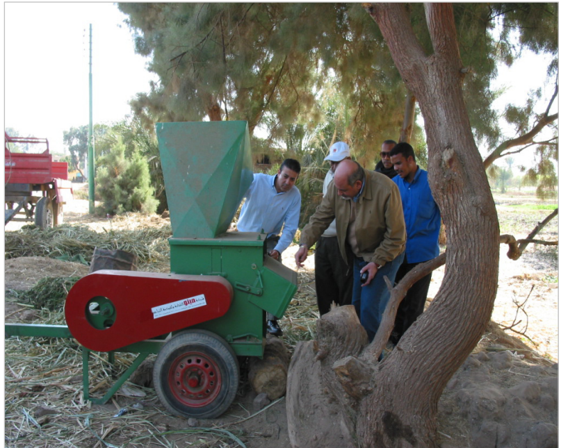
Photograph of an OIG Special Agent inspecting a defective chopper during an investigation in Upper Egypt.

An OIG investigation into improper procurement activities by multiple USAID contractor firms in an agricultural program in Egypt has resulted in the termination of a $17 million contract. The investigation also caused two contractor firms involved in the alleged improper activity to terminate a total of 13 employees, including a Chief of Party and a Deputy Chief of Party. Additionally, the USAID Foreign Service National Cognizant Technical Officer in charge of the program resigned from his position. Finally, the prime contractor for the project issued a credit to USAID for $467,801.