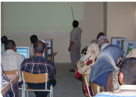
LEFT: Photograph of a computer literacy training class at a regional teacher training center in south central Iraq.