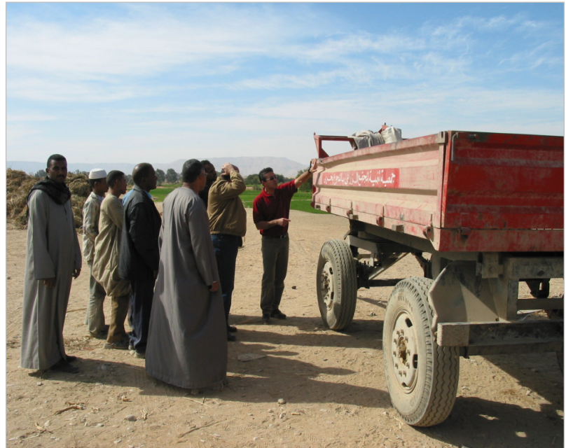
Photograph of an OIG Special Agent in Egypt inspecting a tipper trailer, which turned out to be substandard and overpriced.