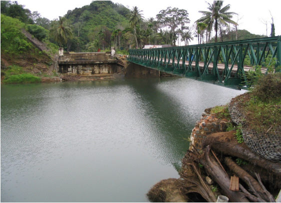
LEFT: Photograph of a river showing that all debris was removed as a result of a bridge that was destroyed by the tsunami. Remnants of the bridge can be seen on each bank just left of the new temporary bridge in Aceh Providence, Indonesia. RIGHT: Photograph of the central community gathering location in Achinamiza, Peru.