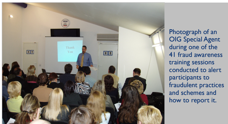
Photograph of an OIG Special Agent during one of the 41 fraud awareness training sessions conducted to alert participants to fraudulent practices and schemes and how to report it.