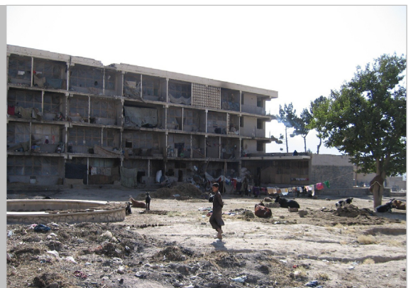
RIGHT: Photograph of a "winterized" (broken windows were covered with plastic sheeting) temporary settlement in an abandoned building in Kabul, Afghanistan.