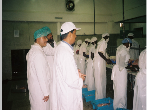
Photograph of fish-processing activities at a company that is a DCA guarantee loan recipient in Kampala, Uganda.

Management decisions were reached on four of the recommendations, and USAID/Uganda agreed to de-obligate over $105,000, which they will reprogram. This reprogramming action could result in over $3.7 million in additional loan guarantees to qualified borrowers.