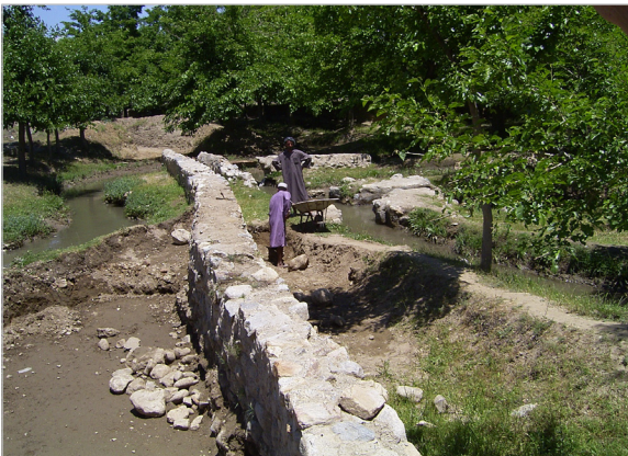
Photographs of the Charkiar Canal's Five-Fingers Extension before rehabilitation (LEFT) and after rehabilitation (RIGHT) in Parwan, Afghanistan.