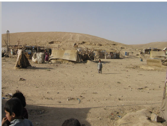
Photograph of a settlement of displaced Afghans, who were intended beneficiaries of some of the $15 million appropriated to assist displaced Afghans in and around Kabul, Afghanistan.