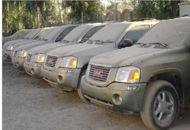
Photograph of vehicles stored uncovered on the USAID/Iraq compound in Baghdad, Iraq.

OIG found that USAID/Iraq's property, valued at $23.5 million in its nonexpendable property database, was not managed in accordance with USAID guidance. Based on a statistical sample, OIG could not verify that a projected $21.3 million was correctly valued in the database because the amounts were not supported by documentation. Additionally, OIG could not verify the existence of a projected $2.9 million in nonexpendable property included in the database. Furthermore, Mission vehicles valued at $2.3 million were not properly safeguarded, and questions of ownership existed regarding nonexpendable property shared with another U.S. Government agency.