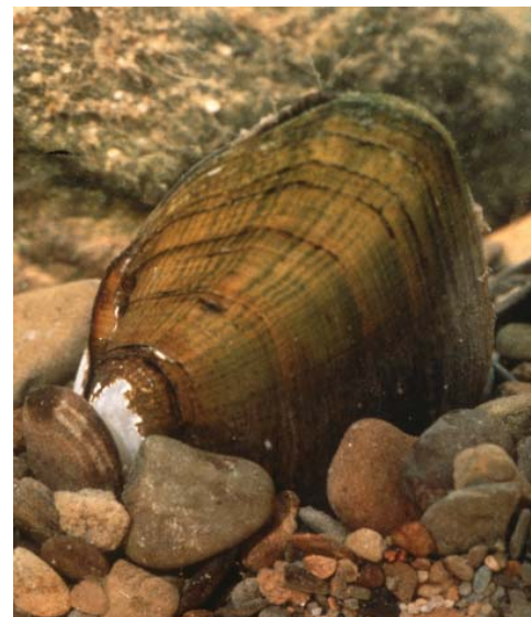
The endangered tan riffleshell is one of many species on the U.S. List of Endangered and Threatened Wildlife and Plants. To see what species are currently on the list, the best place to look is on our web site at http://endangered.fws.gov.

Because of the large number of candidates and the time required to list a species, we developed a priority system designed to direct our efforts toward the plants and animals in the greatest need. In our priority system, the degree or magnitude