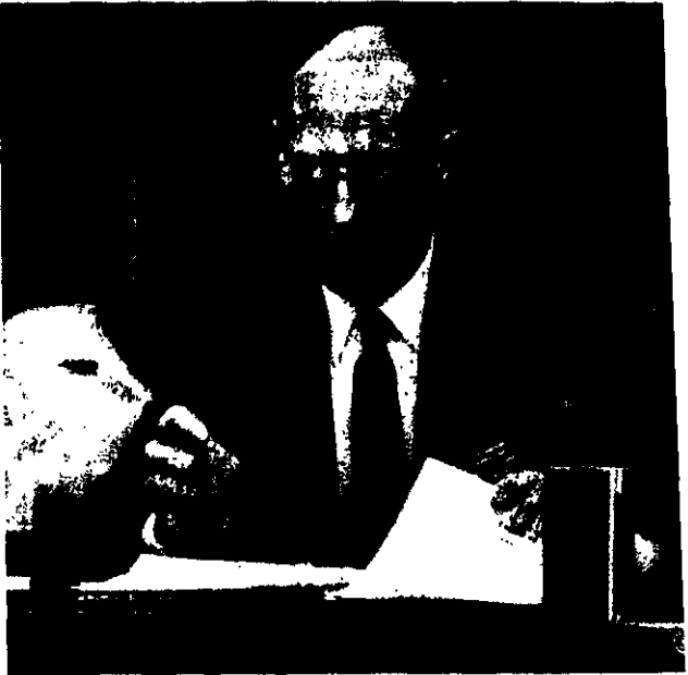
Rep. Roger Stewart, R-Lincoln, on Friday discusses his resolution to make English the nation's official language. Supporters said such a move would ensure economic growth. called it "modern racism."

Cusson argued that "a patriotic spirit, love of country and a little sacrifice" promote national unity, not language.