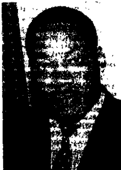
MARTIN LUTHER KING JR.

"There are times when New Hampshire can feel pride in its unique posture," she said. "However, I feel that our unique status vis-a-vis this holiday does