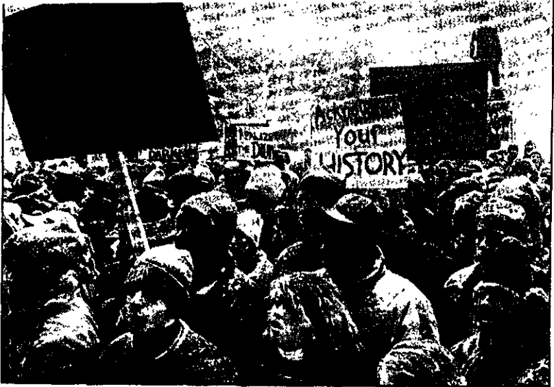
DEMONSTRATORS , mostly from St. Paul's School in Concord, carried placards calling for New Hampshire to honor Martin Luther King Day yesterday at the State House in Concord.