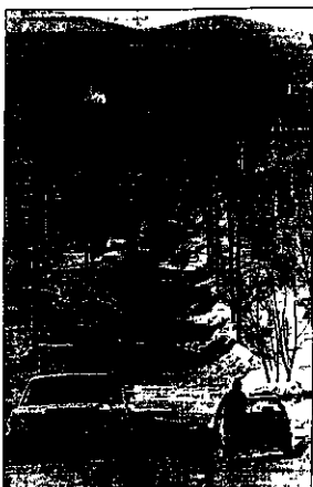
The cost of housing is high in Manchester where cheapest apartment rent for month $40 a month. Housing bill can run $1,200 a year for an average home.