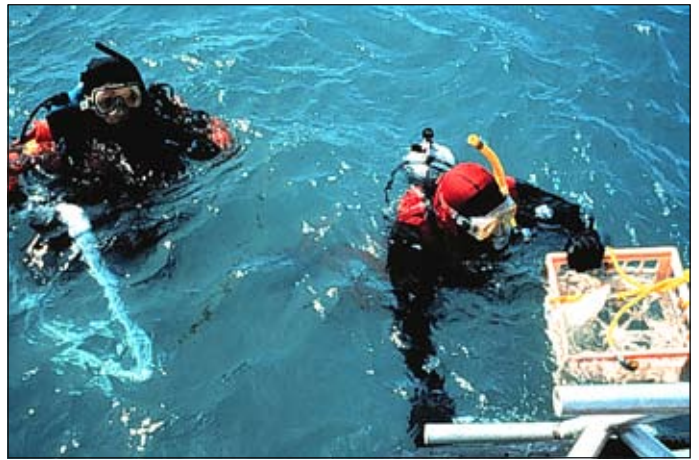
Divers were used for sample collection.

In the 1997 survey, no live native mussels were collected despite a sampling effort specifically modified from prior surveys to locate live individuals. Based on these results, it can be stated that native mussels have been completely eliminated from the open waters of Lake St. Clair. Zebra mussel populations appear to have levelled off in the northwest as evidenced by a decrease in average density from 2,247 per square meter in 1994 to 1,237 per square meter in 1997, and a decrease in the mean size of individuals in the population.