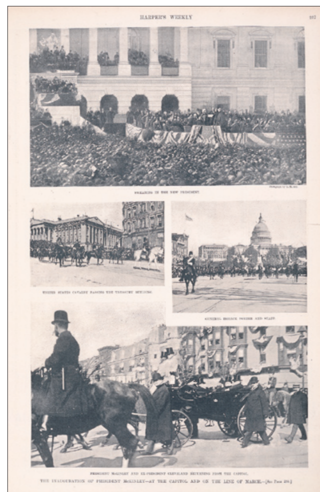
Photography replaced hand-drawn illustrations in the weekly magazines. (See p. 148)

As the 20th century approached, dramatic changes took place that would ultimately signal the demise of the illustrated weeklies. Hand-engraved woodblocks and steel engravings were now replaced by the photographic linecut. While photography had existed earlier, it was not until later in the 19th century that printing technology was able to reproduce such images. This marked the end of the illustrated artist and eventually the illustrated papers. Outmoded by cheaper and faster technology and more accurate images, the last issue of Franks Leslie's Illustrated Newspaper appeared in 1902, while Harper's Weekly finally closed its doors in 1916. In their heyday these magazines, and other illustrated papers, offered unique experiences for the average American—they provided the most realistic depiction of the events and people of the day. ❧