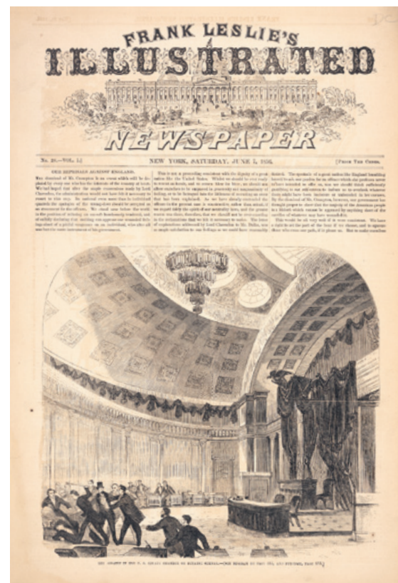
Important and dramatic political events, such as the caning of Senator Sumner, were pictured in the illustrated weeklies. (See p. 17)

While one print can often tell a larger story, numerous prints of the same event also convey important information. The Senate's print collection contains more than 40 engravings depicting the 1868 impeachment of President Andrew Johnson. Throughout the trial, the weeklies illustrated the historic event as it unfolded—from the proceedings in the Senate Chamber to events outside the room. The trial mesmerized the nation for over two months.