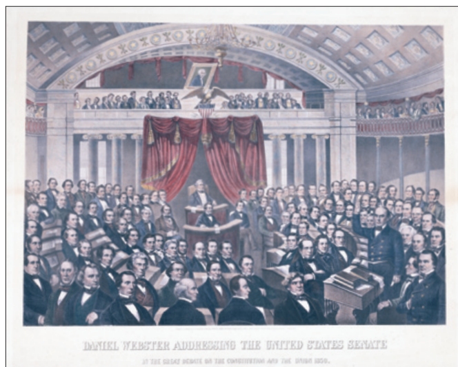
This engraving highlights the dramatic debates of 1850, with Daniel Webster shown delivering his famous “Seventh of March” speech. (See p. 21)