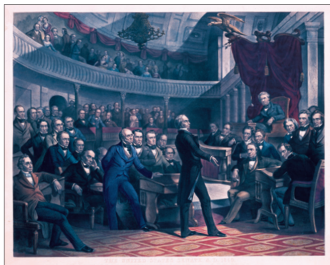
Here Henry Clay presents his series of resolutions as he attempts to save the nation from the disaster of disunion. (See p. 19)