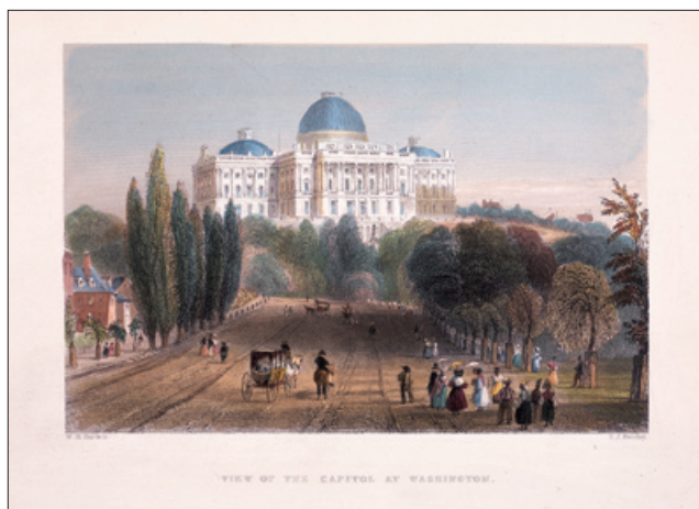
Early engravings of the U.S. Capitol depicted a grand building set on the brow of Jenkins Hill. (See p. 105)

simply did not have the opportunity to see pictures of the early Senate. For them, their view of the new government was formed through written or oral sources.