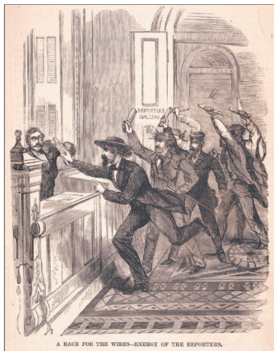
The rush to get news to the public is evident in this 1868 print from the Andrew Johnson impeachment trial. (See p. 62)