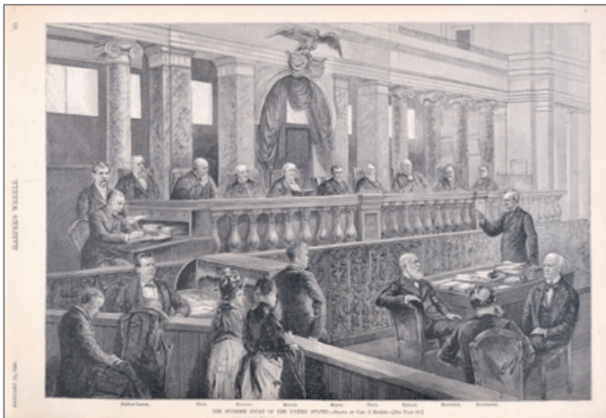
Many 19th-century engravings were extremely accurate in their architectural and furnishing details, such as this 1888 image of the Capitol's Supreme Court Chamber. (See p. 89)

solemn tableau depicted here. It must have seemed that the government would stand as permanently, as firmly, and as grandly as the Capitol Rotunda itself, whatever passing dangers might be posed.