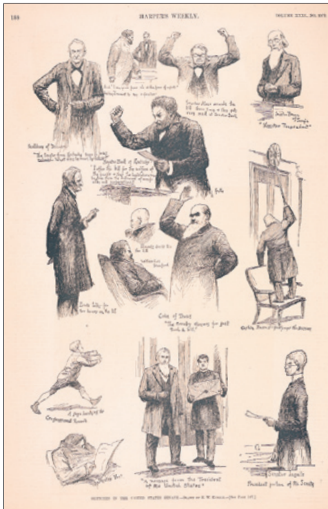
Along with illustrating dramatic political events, the weeklies also highlighted daily activities around the Capitol. (See p. 89)