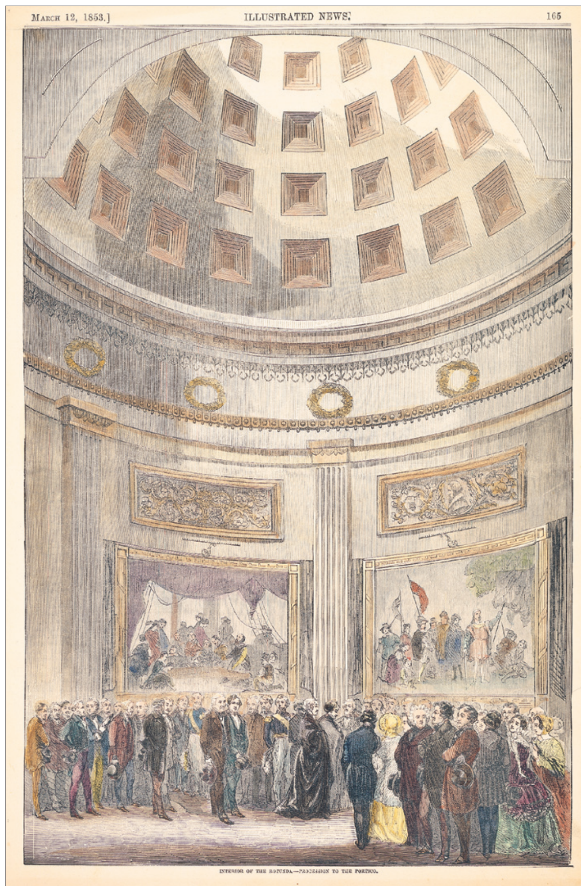
Franklin Pierce's inauguration was one of the first inaugurations to be depicted in the weekly news publications. (See p. 54)