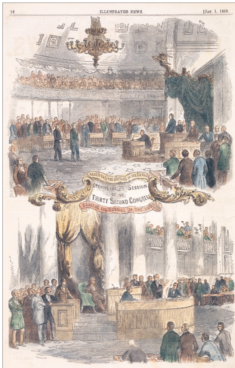
This 1853 engraving is one of the earliest views of the Senate and House Chambers to appear in an illustrated weekly. (See p. 17)

Illustrated Newspaper and Harper's Weekly , that provided the general public with a timely glimpse of the events and people on Capitol Hill. Quick, accurate, and detailed drawings now accompanied stories. The magazines commissioned “special artists” to illustrate the debates in the Senate as they were taking place and to record the major activities of the members. New developments in the early 1850s reduced the time needed to make wood engravings, so pictures appeared within a week of an event, and later within days—a speed never before achieved. Previously, an artist traced an illustration onto a wooden block, but once completed only one engraver could work on it at a time. In the new process, the block was cut into sections so several engravers could work simultaneously, after which the sections were bolted together to form a finished plate. This process enabled publishers to produce engravings in hours rather