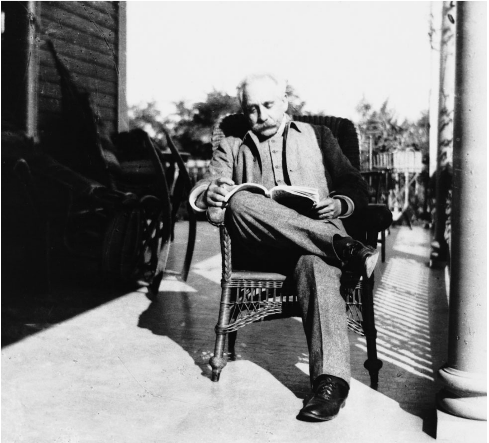
Artist Moses Ezekiel relaxes while visiting his brother in Ohio, ca. 1912.