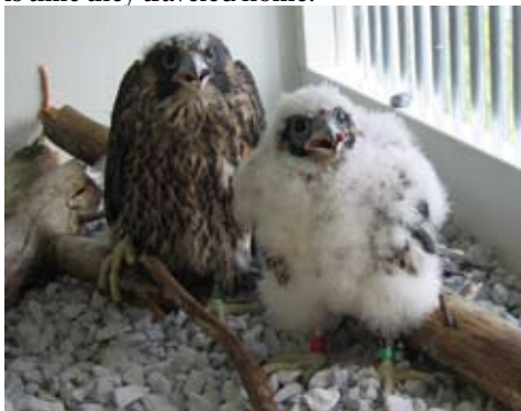
Peregrine falcon chicks in "hack" box

The peregrine falcon is the world's fastest bird. It can reach a speed of over 200 miles per hour in a vertical dive, and in level flight average about 40 to 55 miles per hour. The name "peregrine" comes from Latin peregrinari , "to travel in foreign countries," referring to the peregrine's habit of making long fall and spring migrations between its North American nesting and South American wintering habitats. Despite these travels, these majestic birds have not been seen in New River Gorge National River in many years. It is time they traveled home.