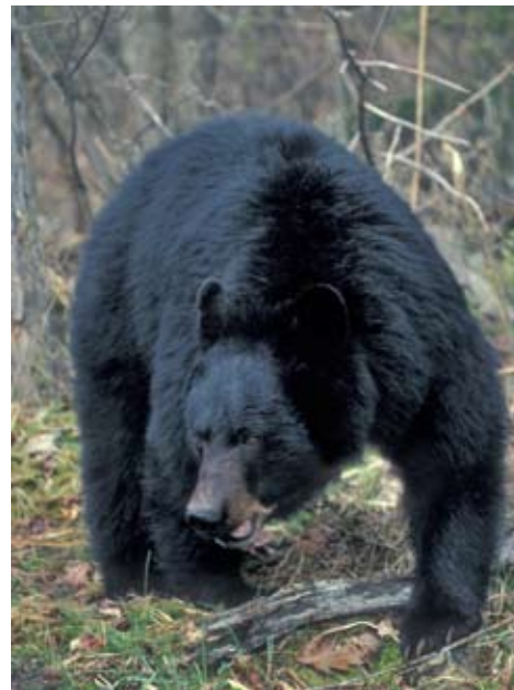
Black bear are common park inhabitants

Animals that become accustomed to treats found in garbage cans may inadvertently consume plastic, paper, fishing line, aluminum foil, Styrofoam, and other indigestible products that can clog their digestive systems. And, when animals learn that humans can provide a cheap and easy food source, they often lose their natural fear of humans, and this leads to safety problems for both parties.