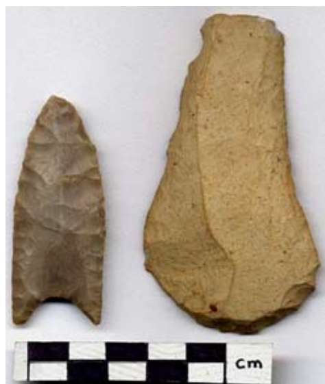
Ancient spearpoint and scraper

The story of American Indians in the New River Gorge area of southern West Virginia is very rich, but often misunderstood. Most of the stories involving native peoples center on “historically” documented tribes and their interaction with the European and African peoples who came into this area in