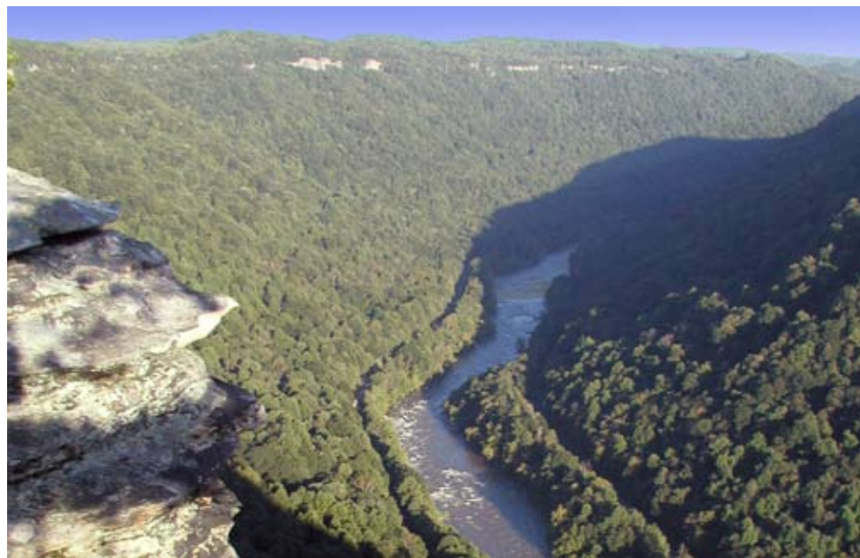
View of the New River from Endless Wall