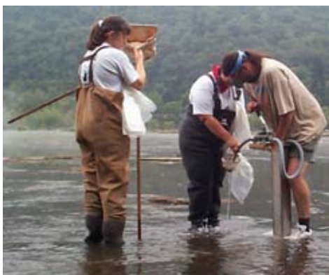
Water quality sampling on the New River

To fulfill its mission to protect the natural resources of these parks, the National Park Service monitors water quality at about forty sites. Regular monitoring indicates that water quality is often impaired by fecal coliform bacteria contamination during periods of high turbidity, recent