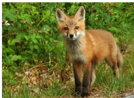
Observe wildlife from a distance and never approach, feed or follow them.