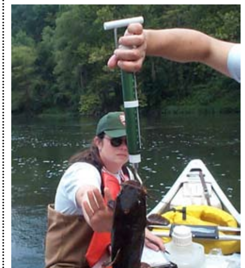
Weighing a catfish prior to release