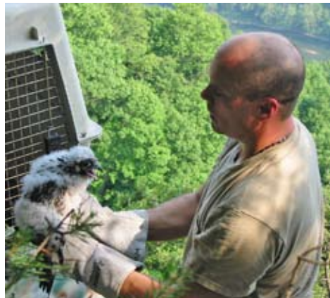
Placement in a temporary home

(fly), they are released from the box, but will return for occasional feedings until their hunting skills allow them to survive on their own.