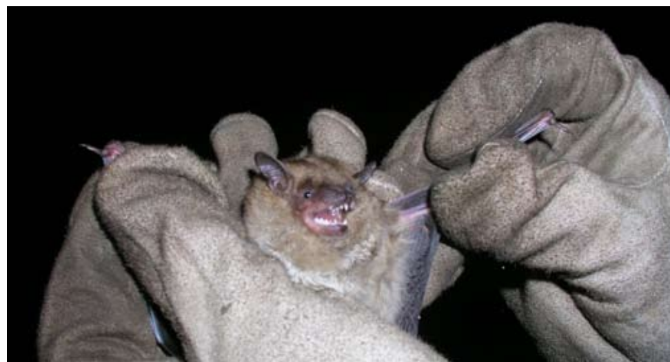
Big brown bat in the careful hands of a researcher

Eastern National is dedicated to helping visitors find the information, materials, and experiences they need to fully understand and appreciate the places they visit. Eastern National accomplishes its mission by dispersing profits from the operation of book-