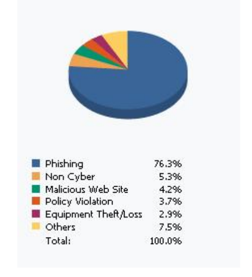
Figure 2: Top Five Incidents vs. All Others

US-CERT encourages all users and organizations to report any activities that you feel meet the criteria for an incident. To learn more about incidents, visit <a href="https://forms.us-cert.gov/report/">https://forms.us-cert.gov/report/</a>. To report phishing, visit <a href="http://www.us-cert.gov/nav/report">http://www.us-cert.gov/nav/report</a> phishing.html.