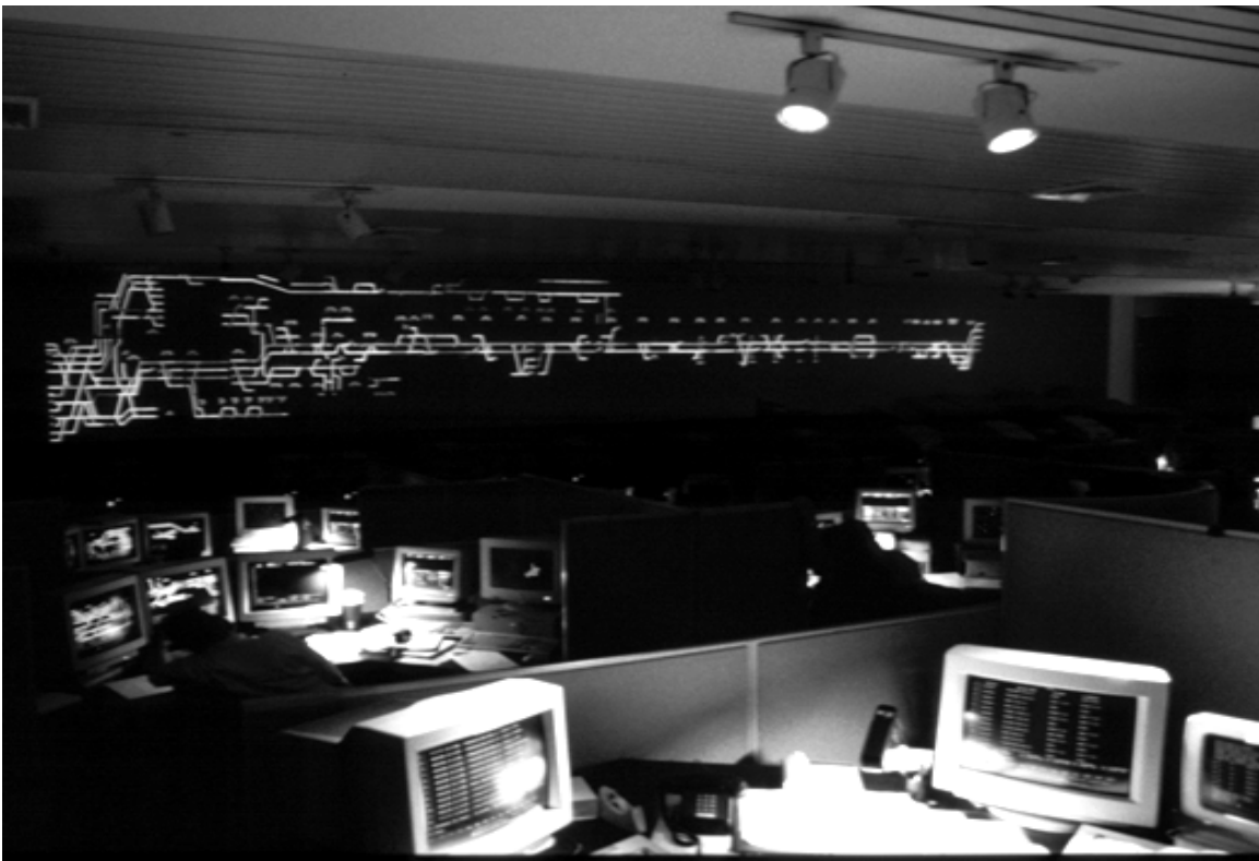
Figure 2. Dispatch Center 1. The Wall Panel Overview Schematic is Projected at the Front of the Room.

Figure 2 is a picture of Dispatch Center 1. It shows several dispatcher workstations. The large wall panel overview is in the front of the room.