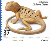
Reticulate Collared Lizard