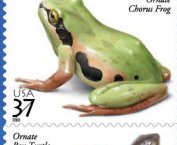
Ornate Chorus Frog