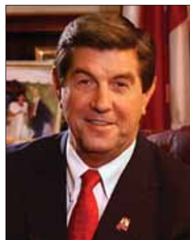
STATE OF ALABAMA

First and foremost, the governor must understand and accept the fact that he/she is the primary person responsible for response and crisis management within his/her state. All citizens look to their governor as the person ultimately responsible. That is not to take away from the local responsibility of mayors, city councils, and county commissions, but, in truth and fact, “the buck stops at the governor.” Secondly, although the governor must be the leader of his/her state, the governor must also be prepared to delegate.