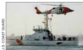
U.S. COAST GUARD

The Coast Guard is a military, multi-mission, maritime service within the Department of Homeland Security and one of the nation's five