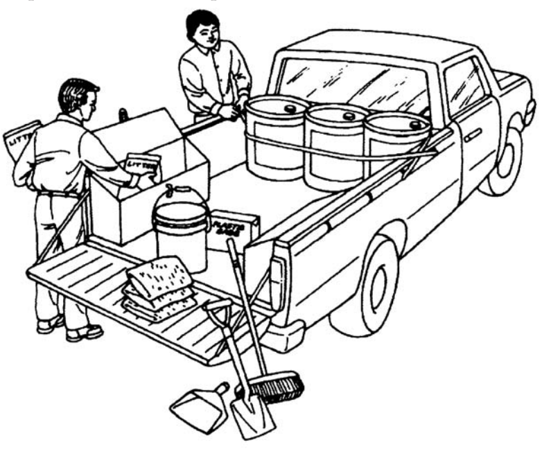
Always carry an emergency spill kit and carefully secure all pesticide containers.

Never leave pesticides unattended. You are legally responsible if people are accidentally poisoned from pesticides left unattended in your vehicle. Move the pesticides into your storage facility as soon as possible. Inspect the vehicle thoroughly after unloading to determine if any containers were damaged or any pesticide leaked or spilled.