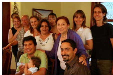
The Healthy Air for Northeast Denver partnership includes a team of community health workers, or "promotoras," who educate primarily Spanish-speaking residents about indoor air hazards.