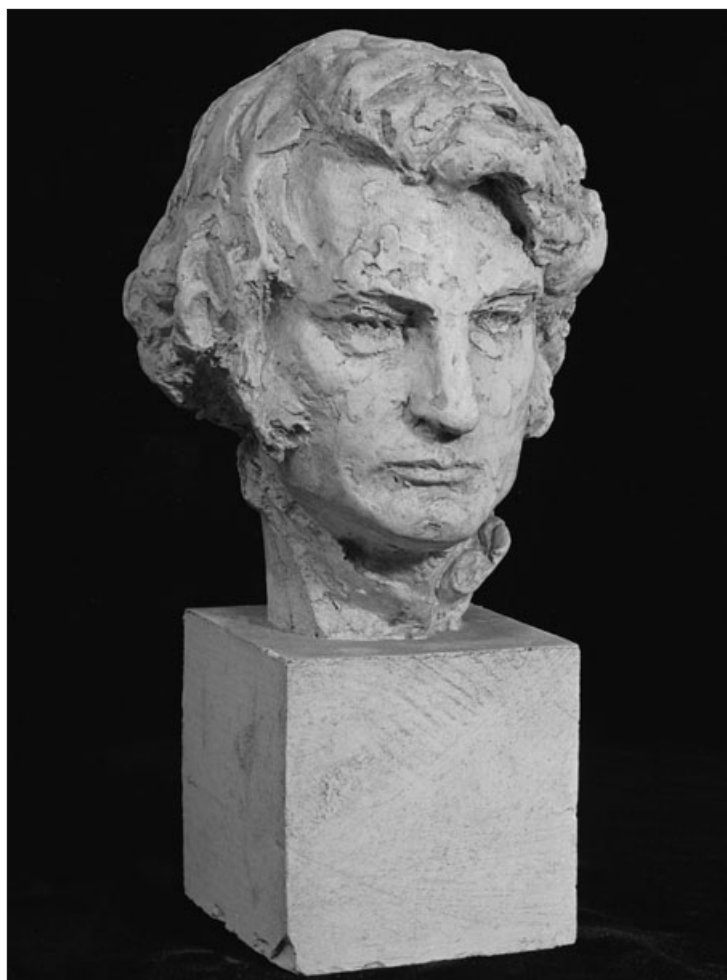
The plaster model for the bust of Chief Justice Roger B. Taney by Augustus Saint-Gaudens.

(U.S. Department of the Interior, National Park Service, Saint-Gaudens National Historic Site, Cornish, NH)