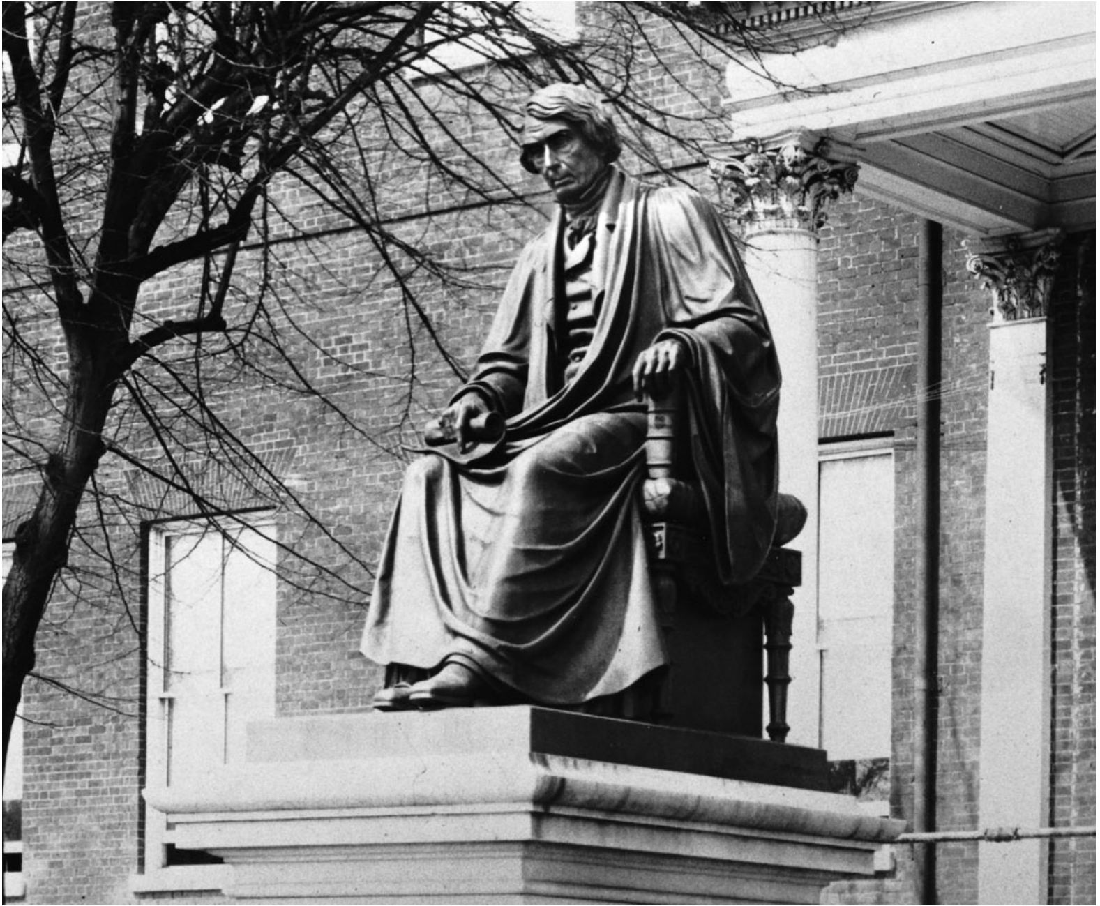
Augustus Saint-Gaudens copied the head of this 1872 statue by William Rinehart for his Senate bust of Roger B. Taney.