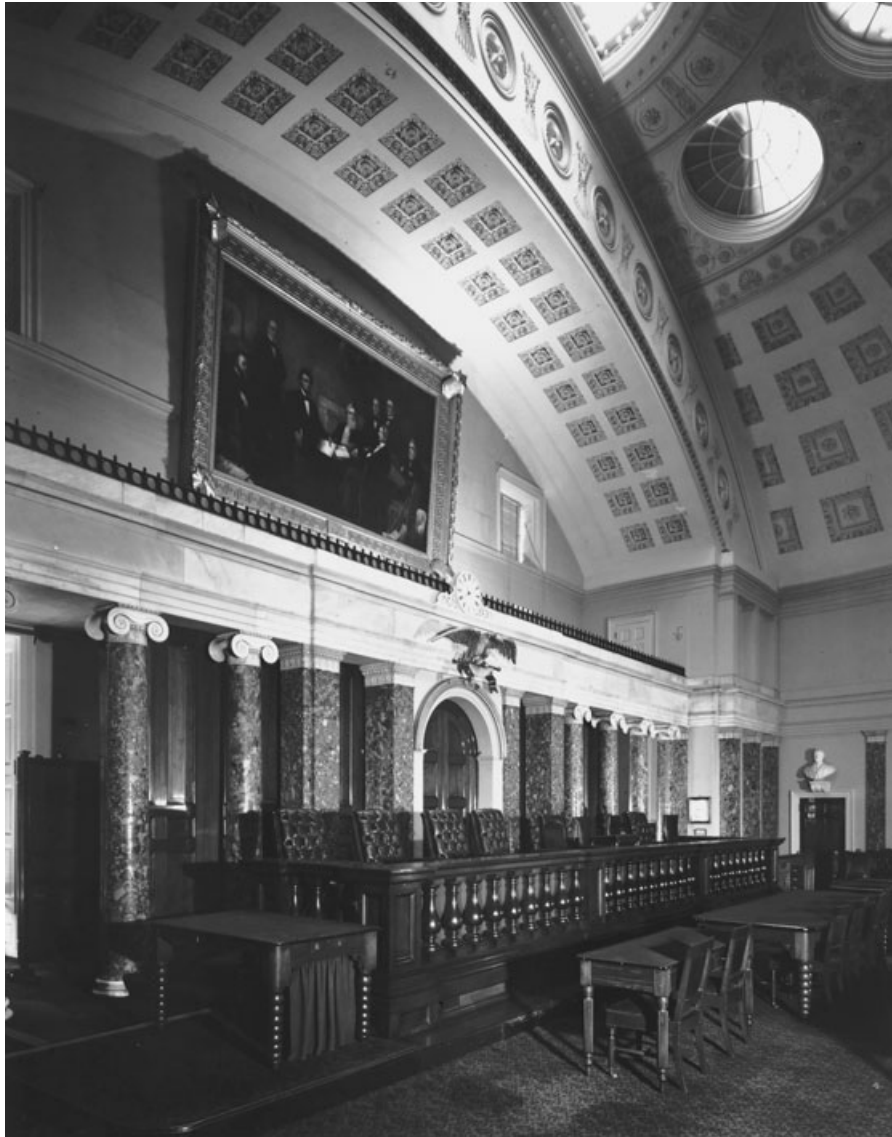
The Senate's painting, First Reading of the Emancipation Proclamation by Francis B. Carpenter, on display in the Supreme Court Chamber in the Capitol in 1958.