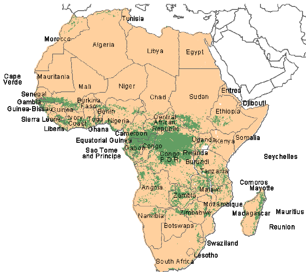
Figure 3.2. Forested Areas in Africa

In forested (or formerly forested) area of Africa, conflict timber poses potentially grave problems. To date, Type I incidents of conflict timber (conflict fueled by timber) outnumber Type II incidents (conflict over timber resources). Given the rate at which deforestation is proceeding in West Africa, however, the costs of Type II conflict have not yet registered in any significant degree.