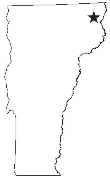
Location of the Nulhegan Basin Division in Essex County, Vermont

Located just a few miles south of the Canadian border, the Nulhegan Basin's vegetation most closely resembles that of the northern Appalachian Mountains but also contains elements of the boreal forest that occurs farther to the north. The Basin is predominantly forested, but contains many streams,