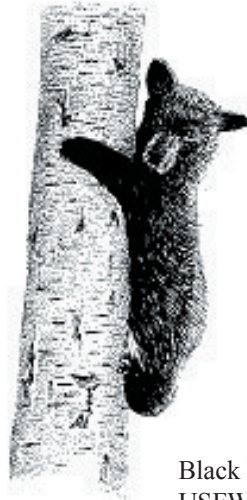
Black bear

The Service and the Vermont Agency of Natural Resources collaborate on management of habitat, wildlife, and public uses on the refuge lands and adjacent State lands.