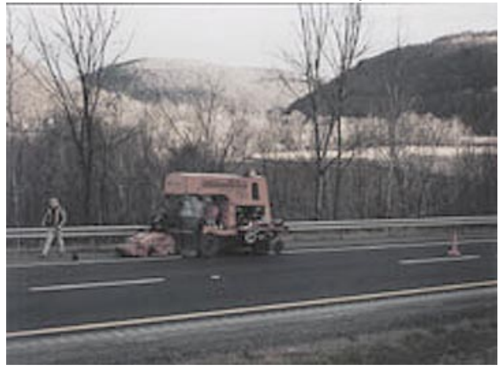
FIGURE 2. New York State's Milled Rumble Strip Design